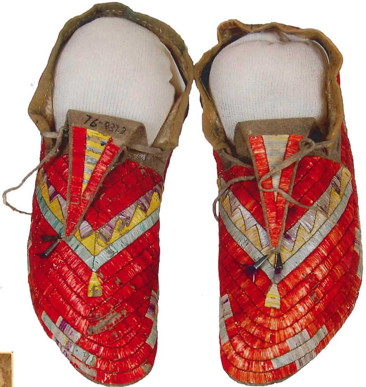
Quillwork moccasins made by Standing Bear's wife.