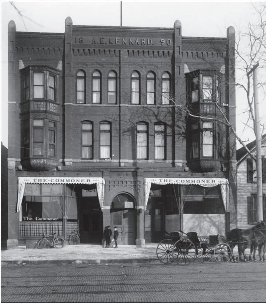
Western Glass and Paint Company's first building located at 12th and L Street. By the time of this photo it housed the offices of William J. Bryan's newspaper, The Commoner.

and railroads. He introduced several new pieces of legislation, including support of free libraries and appointment of a state inspector of illuminating oils; he also fought against a bill to regulate railroad rates. 44