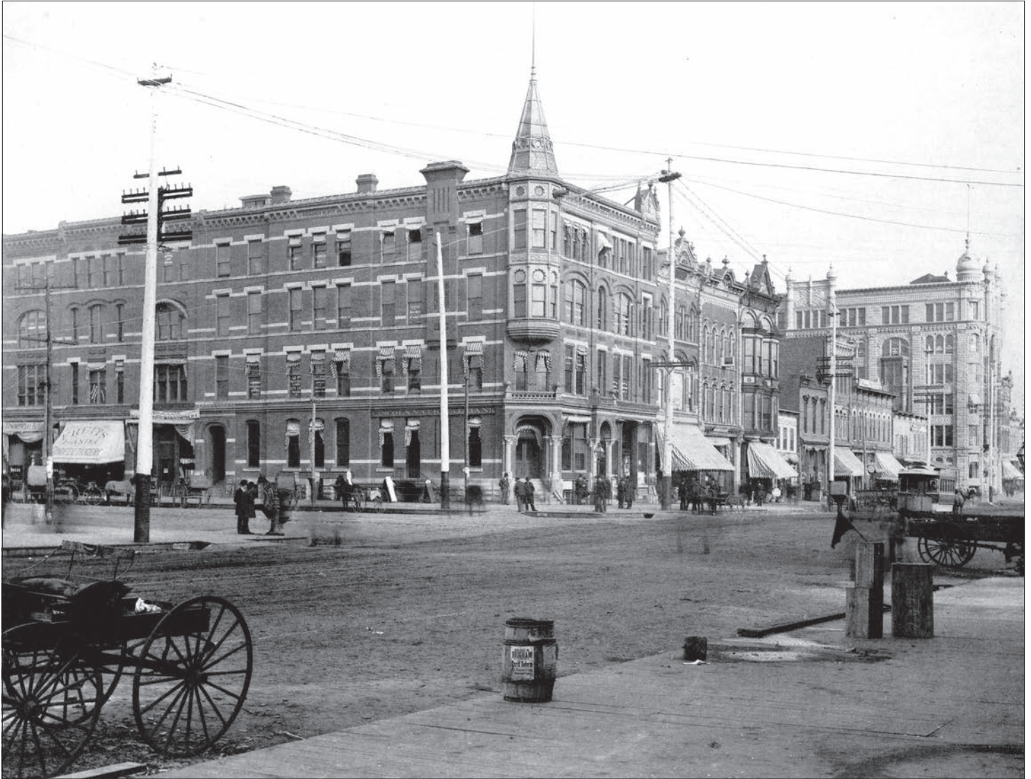
View of the Richards Block on the northeast corner of 11th and O Streets. The offices of T. P. Kennard & Son were located on its second floor.