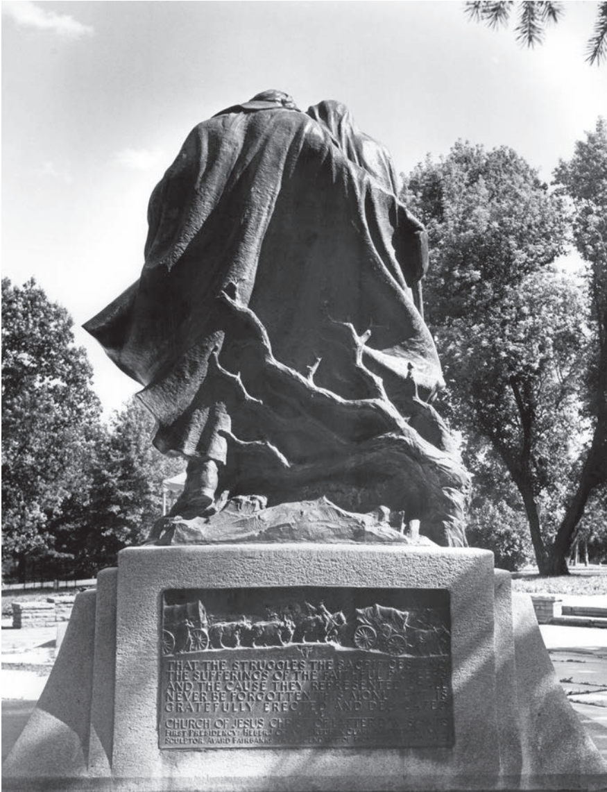
Figure 9: Fairbanks. A Tragedy of Winter Quarters, Winter Quarters Monument. 1936. Omaha, Nebraska.