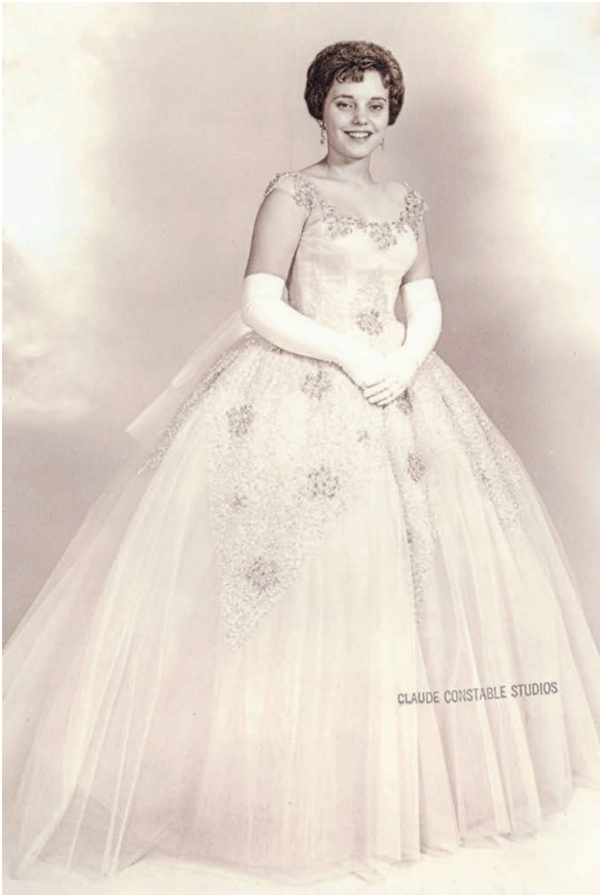
Same gown as on p. 138.

sales representatives from Saks and the thirty-three young ladies of the court to organize all fittings and wardrobe details.