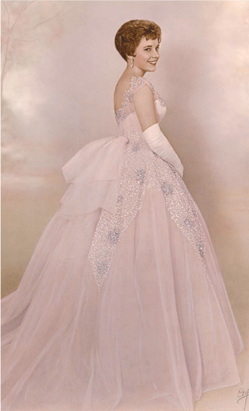
The princess and countess gowns were less extravagant than the queen gown, but still remarkable with full hoop skirts and modest trains.