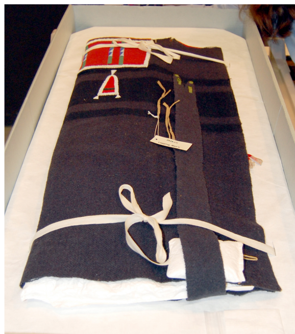
Fig. 1 Rehousing Native American leggings.