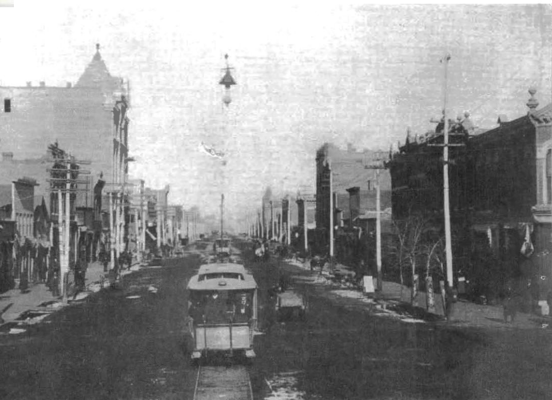
Below— Central Avenue, Kearney, about 1891