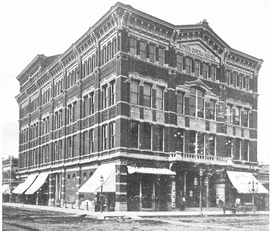
Boyd's Opera House in Omaha was built in 1881 and burned in 1893.