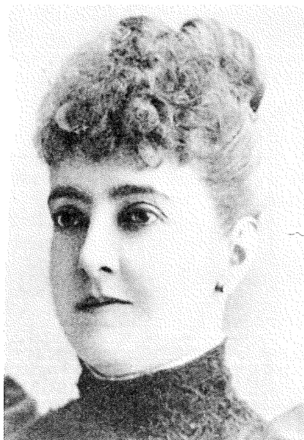
Adelina Patti. From William Armstrong, The Romantic World of Music (1922)

"Home, Sweet Home"); after an intermission came excerpts from the first and second acts of Rossini's Semiramide , sung in costume with a minimal amount of scenery. This performance attracted a huge crowd, estimated by the local press at anywhere from 4,300 to 6,000. According to the Omaha Daily Herald , the receipts amounted to a staggering $12,000.