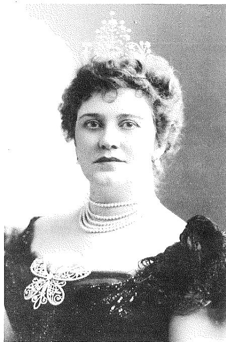
Lillian Nordica in a publicity photo by Morrison of Chicago, about 1896.