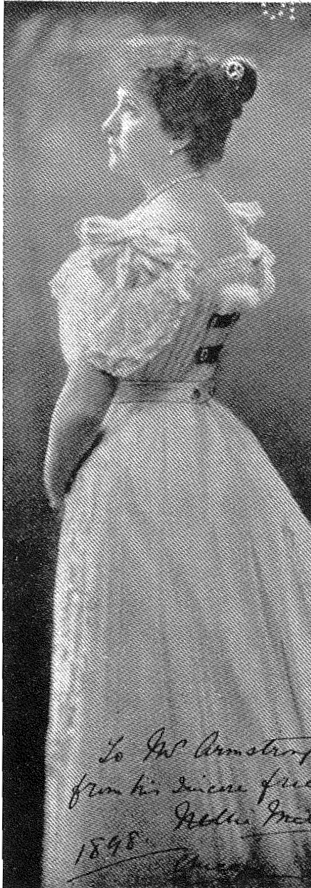
Nellie Melba, 1898. From William Armstrong, The Romantic World of Music (1922)