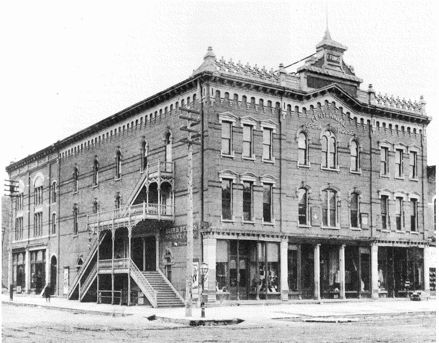
Funke's Opera House, Lincoln.