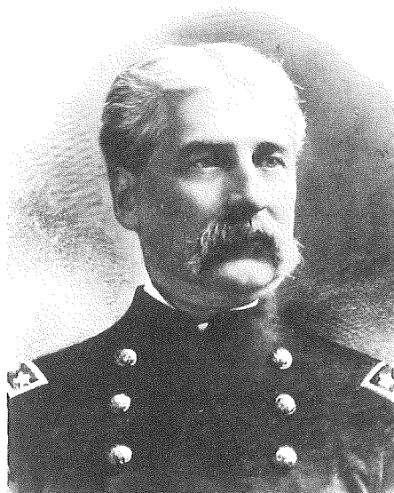
A frustrated Col. Edward Hatch, commanding officer of Fort Davis, Texas, wished his wife Hattie would "let me run the post."