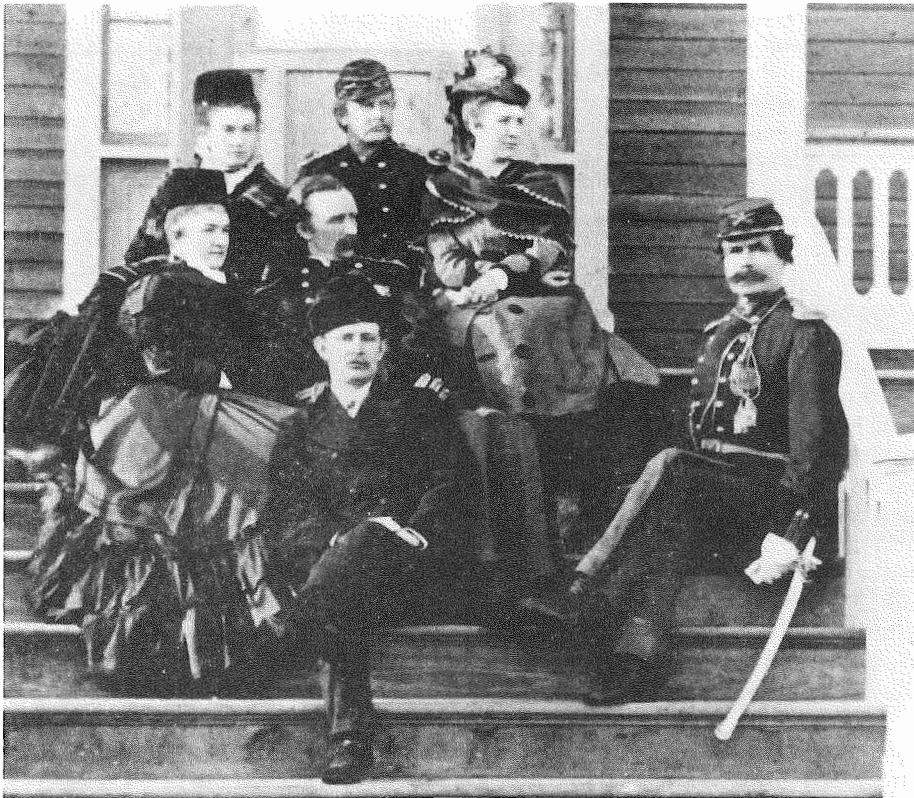
Elizabeth Custer (seated, middle row, left), the most famous wife of a frontier army officer, with her husband at Fort Abraham Lincoln, Dakota Territory.

pleasant, and peaceful, when regulations and unofficial army traditions severely restricted and molded their worlds. Many, however, followed Sherman's advice, and as Libbie Custer penned, "[A]lthough army women have no visible thrones or scepters, nor any acknowledged rights according to military law, I never knew such queens as they, or saw more willing subjects than they govern." And it is here in the phrase "willing subjects that they govern" that one can see most clearly the influence of these ladies on the frontier army. 5