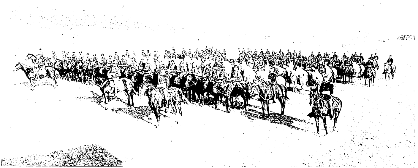
Squadron of the Ninth Cavalry at Fort Robinson, about 1892. This photograph was taken west of the fort.