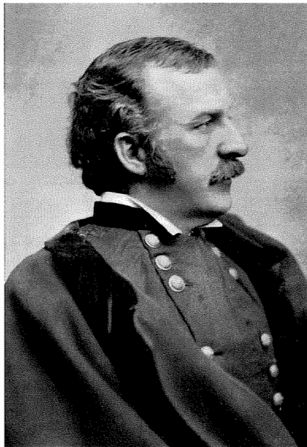
Gen. Nelson A. Miles was among the most successful soldier-investors.