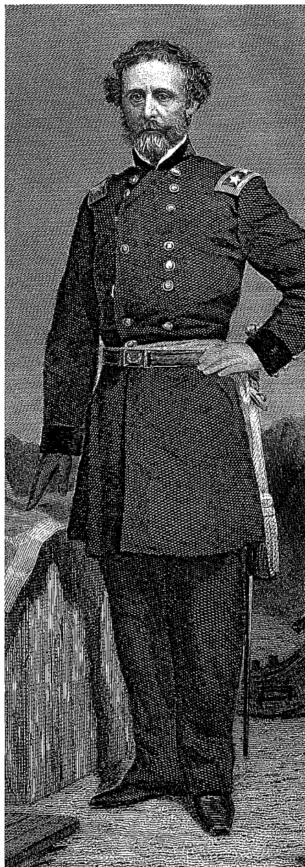
John C. Frémont, as a Civil War officer.

In the era of Gilded Age politics, when conflicts of interest clouded many economic associations, some military officers tempted the ethical limits more than others. Beginning with his 1857