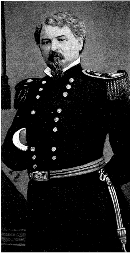
Gen. Samuel D. Sturgis speculated in mining and real estate in the Black Hills.

Mining Company, capitalized at more than two million dollars. Although he never cashed in on a big bonanza, Heintzelman maintained a sizable income and a comfortable lifestyle exceeding that provided by his army pay. Always one to maintain a policy of diversity in his investments, he owned or held stock in a ferry company, a grocery business, a ranch, and a railroad. Despite his numerous business associations, Heintzelman was never accused of slighting his military duties. 14