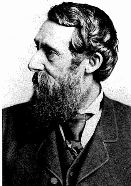
Col. Benjamin H. Grierson.