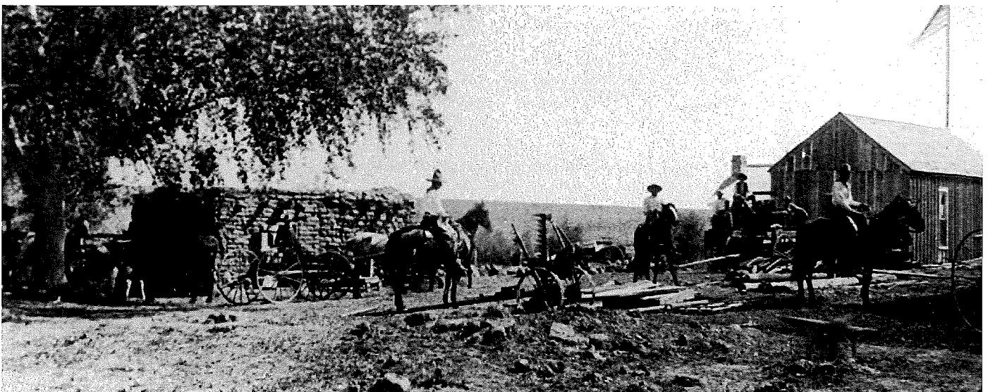
Grierson's Spring Valley Ranch. Col. Grierson is seated in the buckboard.