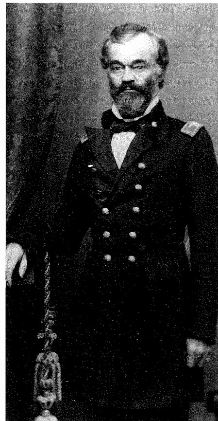
By the time of the Civil War, when this photograph was taken, Col. Samuel P. Heintzelman had already made numerous investments in Western mining and business ventures.

Especially noteworthy were the mining operations of Samuel Peter Heintzelman, who began service in the Second Infantry in 1826 and performed meritoriously during the Mexican War. While stationed in California during the early phases of the Gold Rush, he demonstrated his acumen by buying valuable town lots in the port of San Diego. After being transferred to Fort Yuma, Arizona, in 1850, he created a partnership with important local residents such as Charles Poston, and became president of the Sonora Exploring and