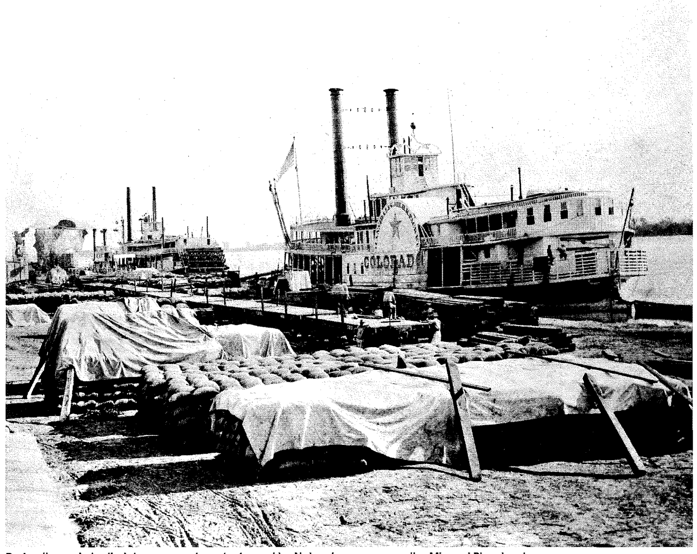
During the early territorial years, most products used by Nebraskans came up the Missouri River by steamboat. As Morton indicates, a surplus of agricultural products was being shipped out of the territory by the spring of 1859. RG3761:4-26

agriculture must and will carve out, for an industrious people, a wealth and a happiness the like of which the world has never dreamed of before.