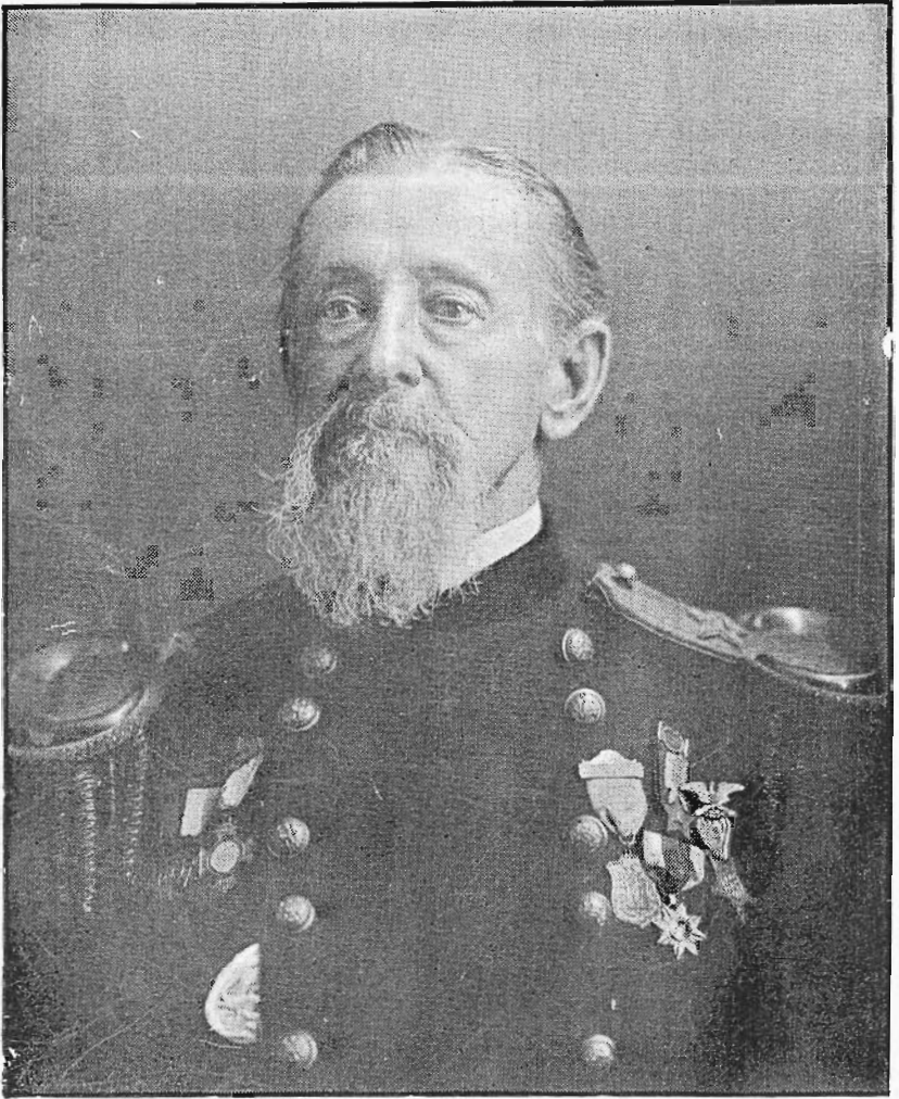
General Henry B. Carrington

. . . whose untimely arrival, June 13, 1866, at Fort Laramie with 700 men to establish military posts along the Bozeman Trail, drove Red Cloud and Man Afraid of His Horse from the treaty council and precipitated the Bozeman Trail War.