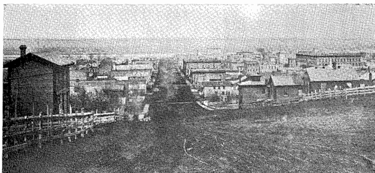
"Omaha, a Growing City of 25,000", About 1873

it is estimated that some 75,000 people, the greatest ever known at Omaha, crossed the river. 34 One emigrant stated that one-half the total Platte emigration passed through the "Twin Cities". 35