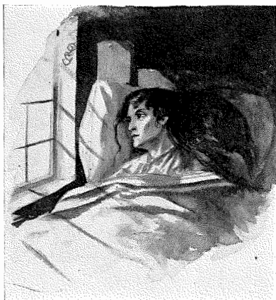
"LONG AFTER JOHN HAD GONE TO SLEEP SHE LAY LOOKING OUT AT THE FULL MOON."

Sam heard her from his bed on the other side of the room, and called to her.