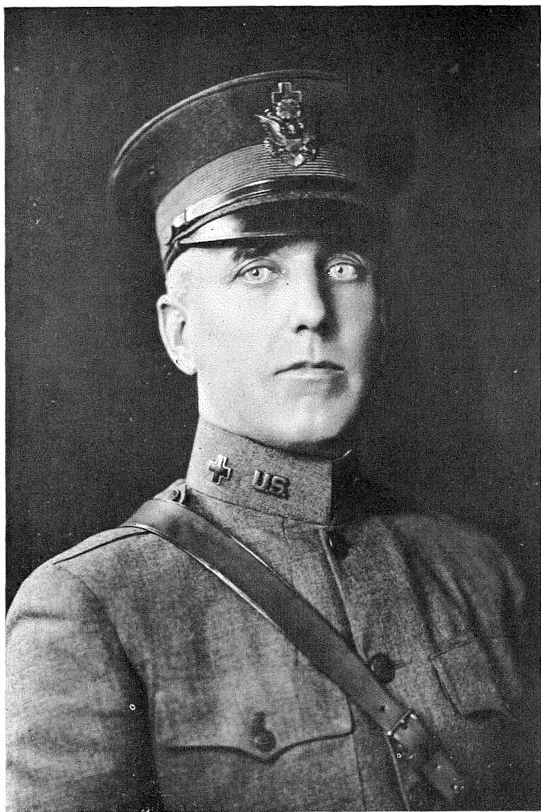
MAJOR L. B. FENNER OF BURWELL

Deputy Commissioner of the Red Cross in Europe, 1918