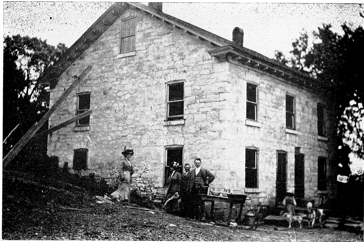
LATTA HOME AT ROCK BLUFF