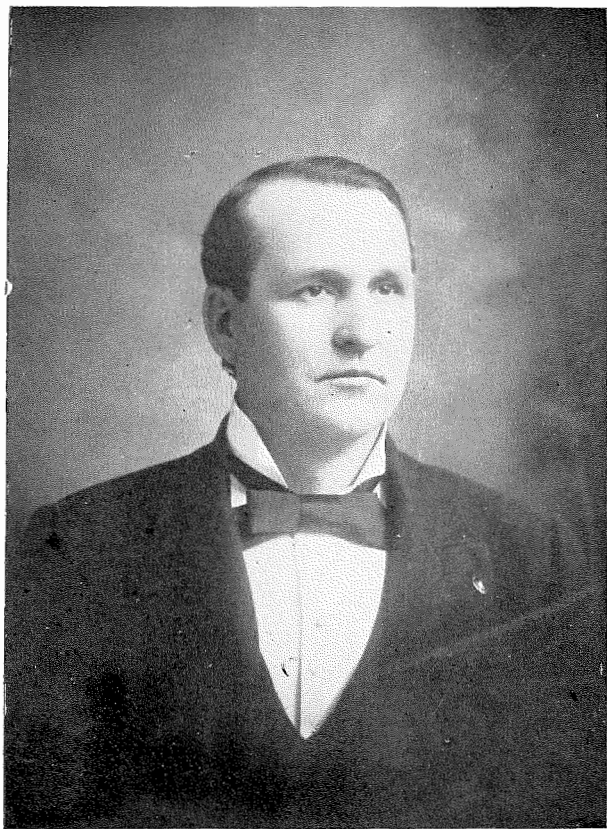
SILAS A. HOLCOMB

From a photograph taken about the time he served as Governor of Nebraska