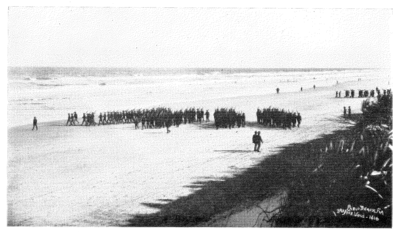
Company M. Third Nebraska Volunteer Infantry, in training at Pablo Beach, Florida, 1898.