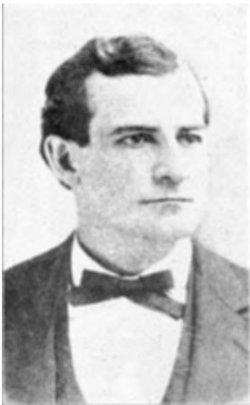
WILLIAM JENNINGS BRYAN