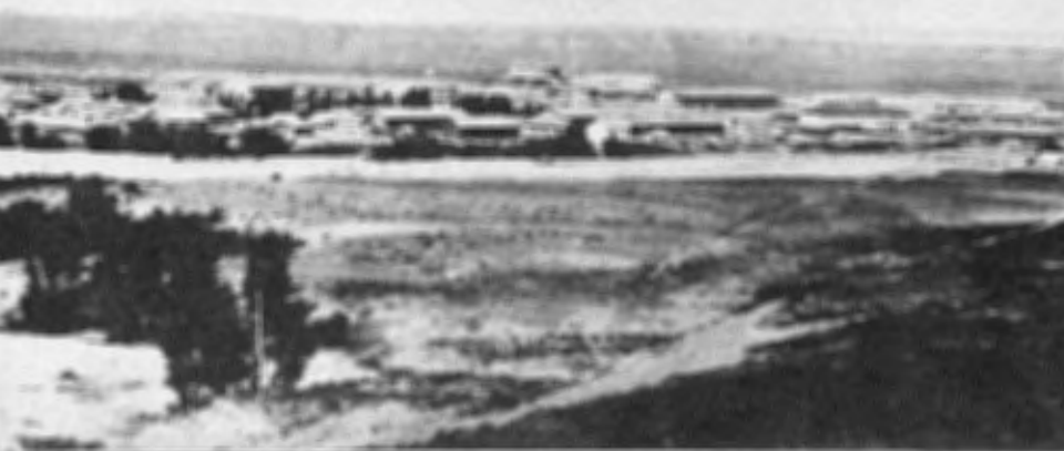
Above: Fort Laramie, view to the west, about 1884.