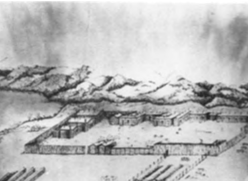
Below: Sketch of Fort Totten, Dakota Territory, about 1867.