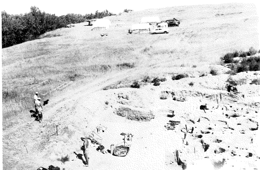
The field party's camp and view of excavation of a prehistoric Indian house floor near Chamberlain, South Dakota.