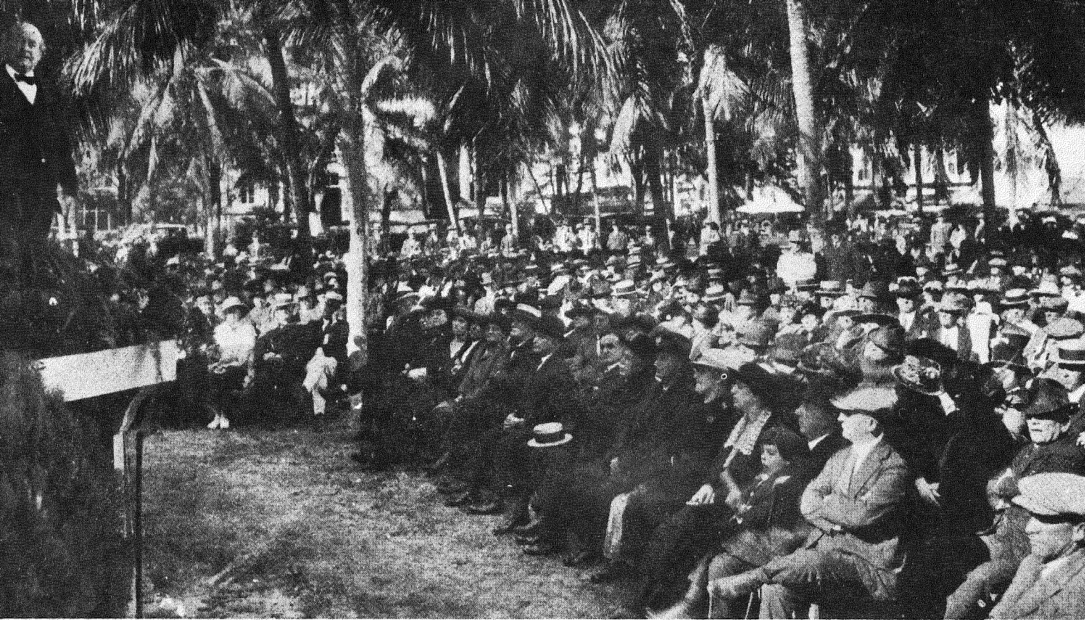
William Jennings Bryan's Bible Class under the Palms