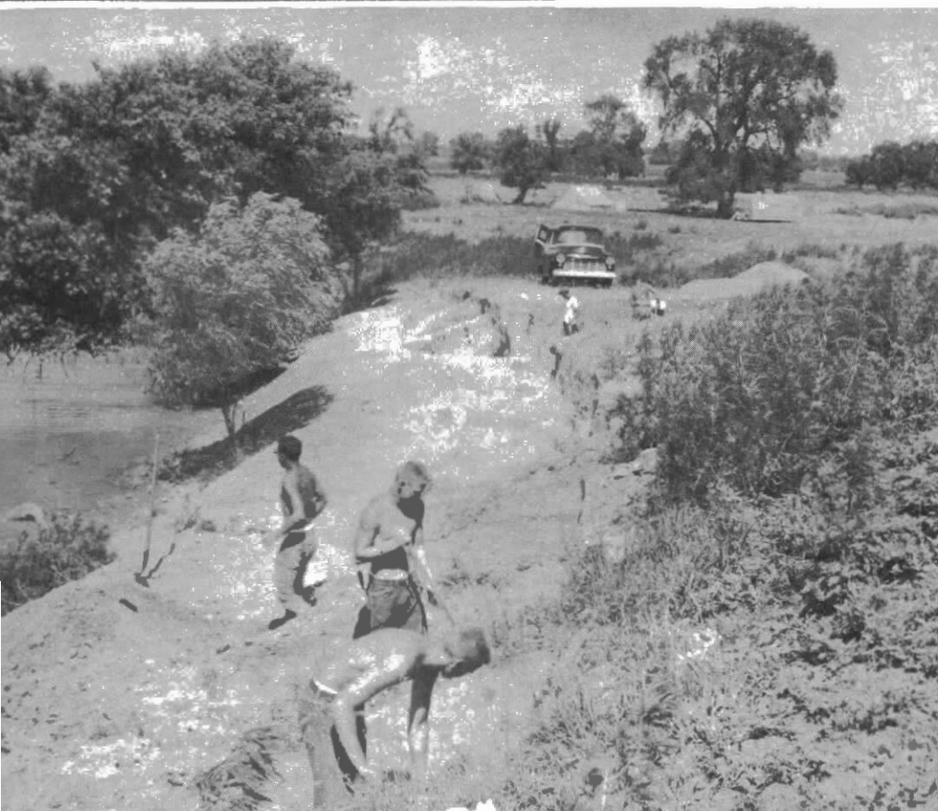
Society's Field Party Excavates Site at Logan Creek, Burt County, Summer, 1957.