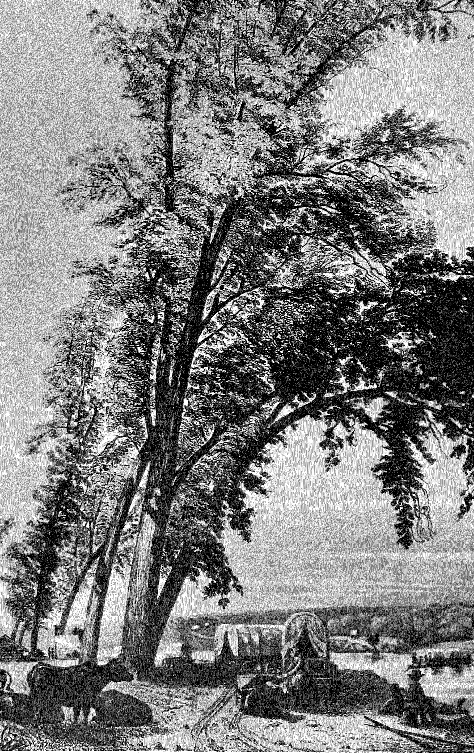
Council Bluffs Ferry, 1853 (From a sketch by Frederick Piercy)