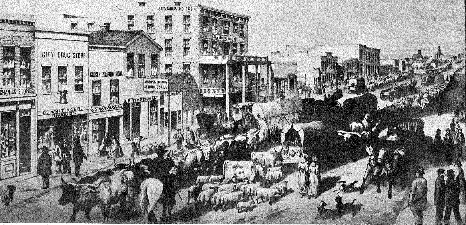
Nebraska City—Main Street, Looking West, 1865