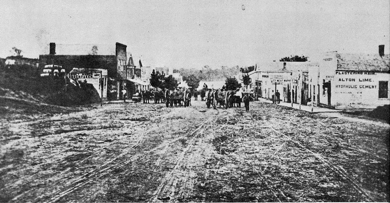
Brownville Street Scene, about 1860