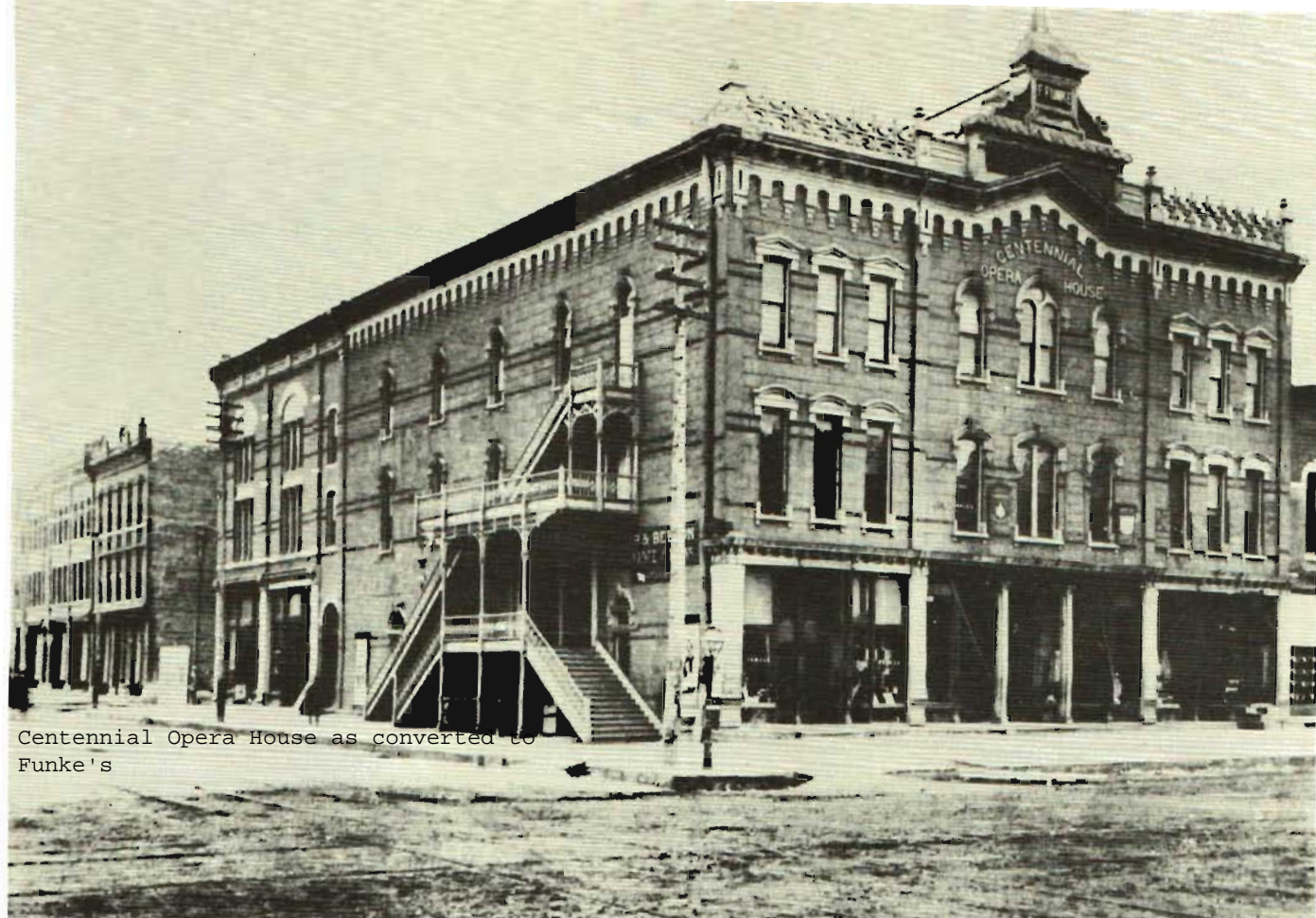
Centennial Opera House as converted to Funke's