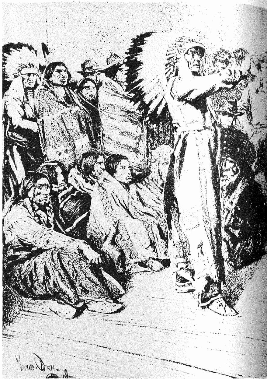
Dull Knife's Defiance, from sketch by Maynard Dixon.