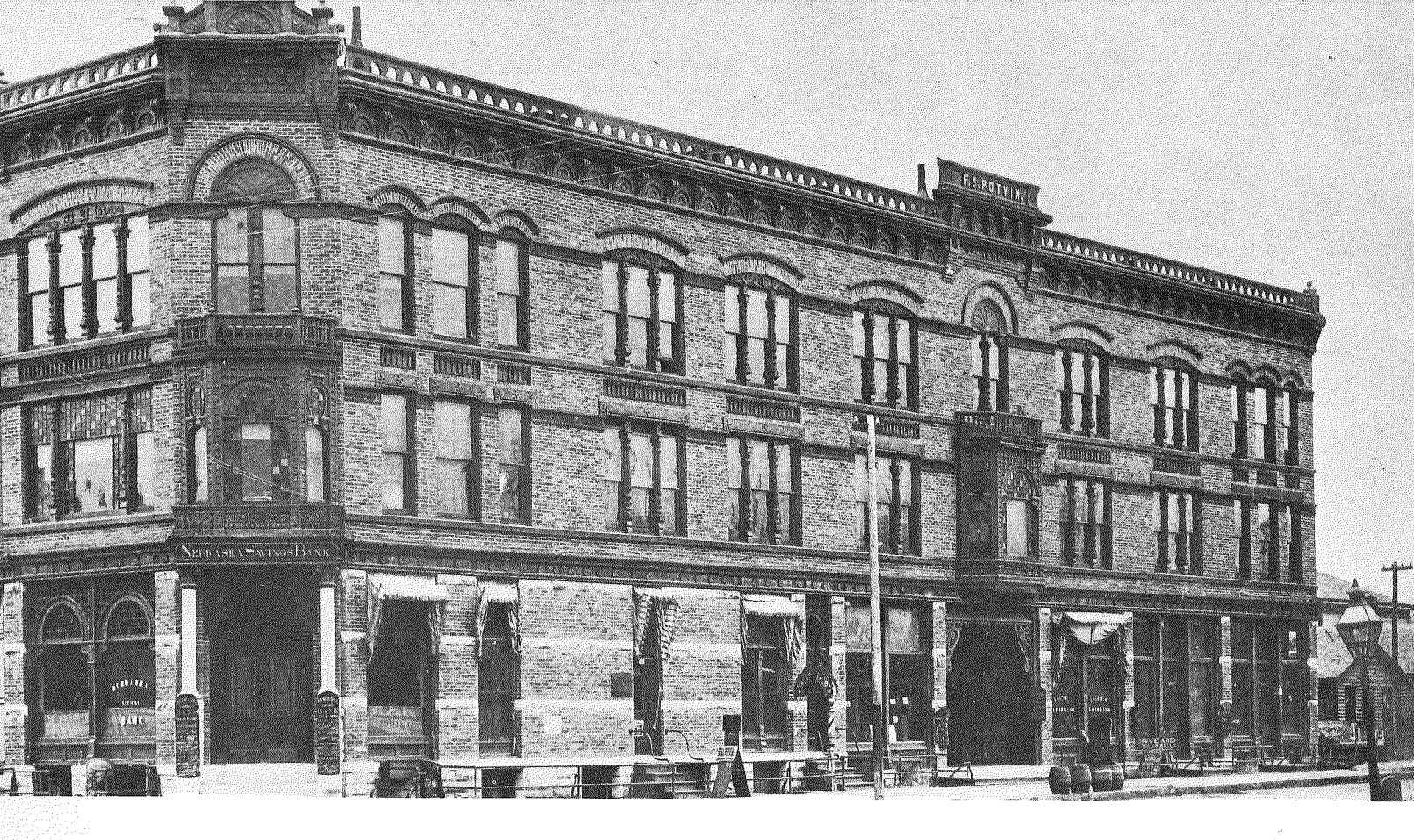
The Potvin Block, Lincoln, Nebraska