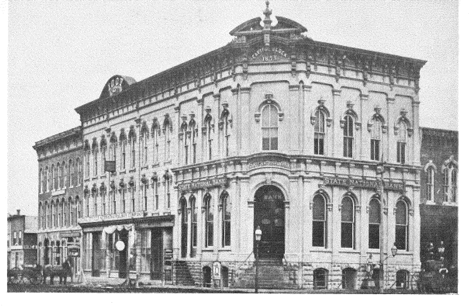
The Capitol Block, Lincoln, Nebraska