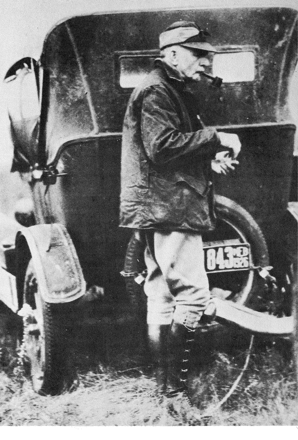
Charles G. Dawes on a Nebraska hunting trip in 1926