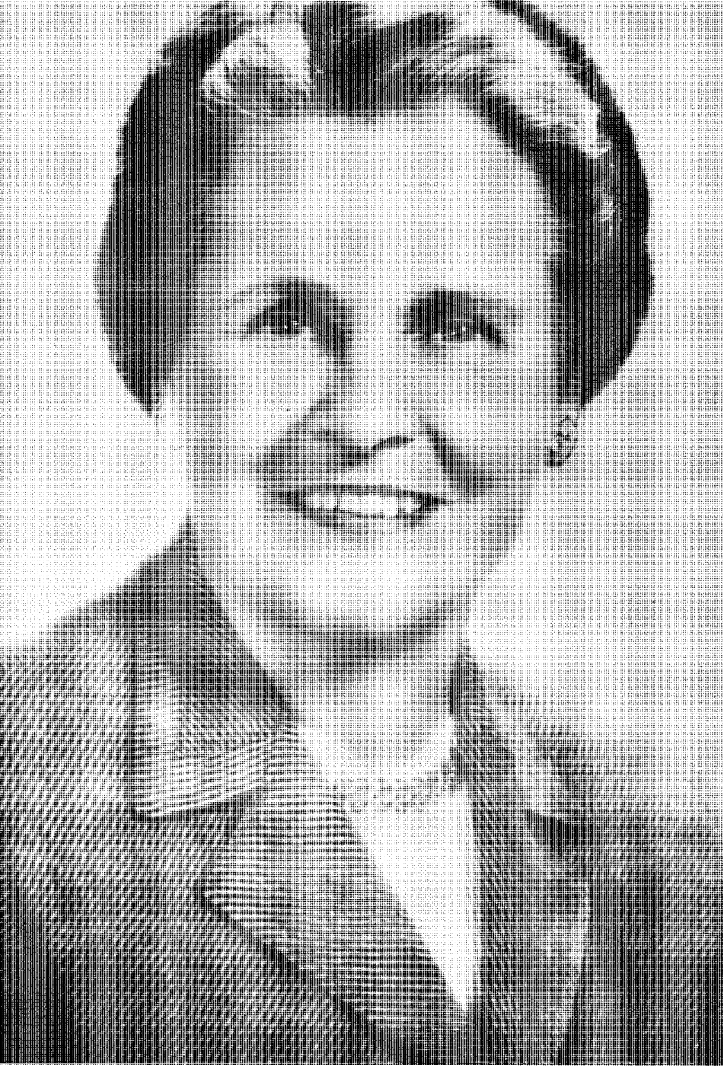
Senator Eva Bowring