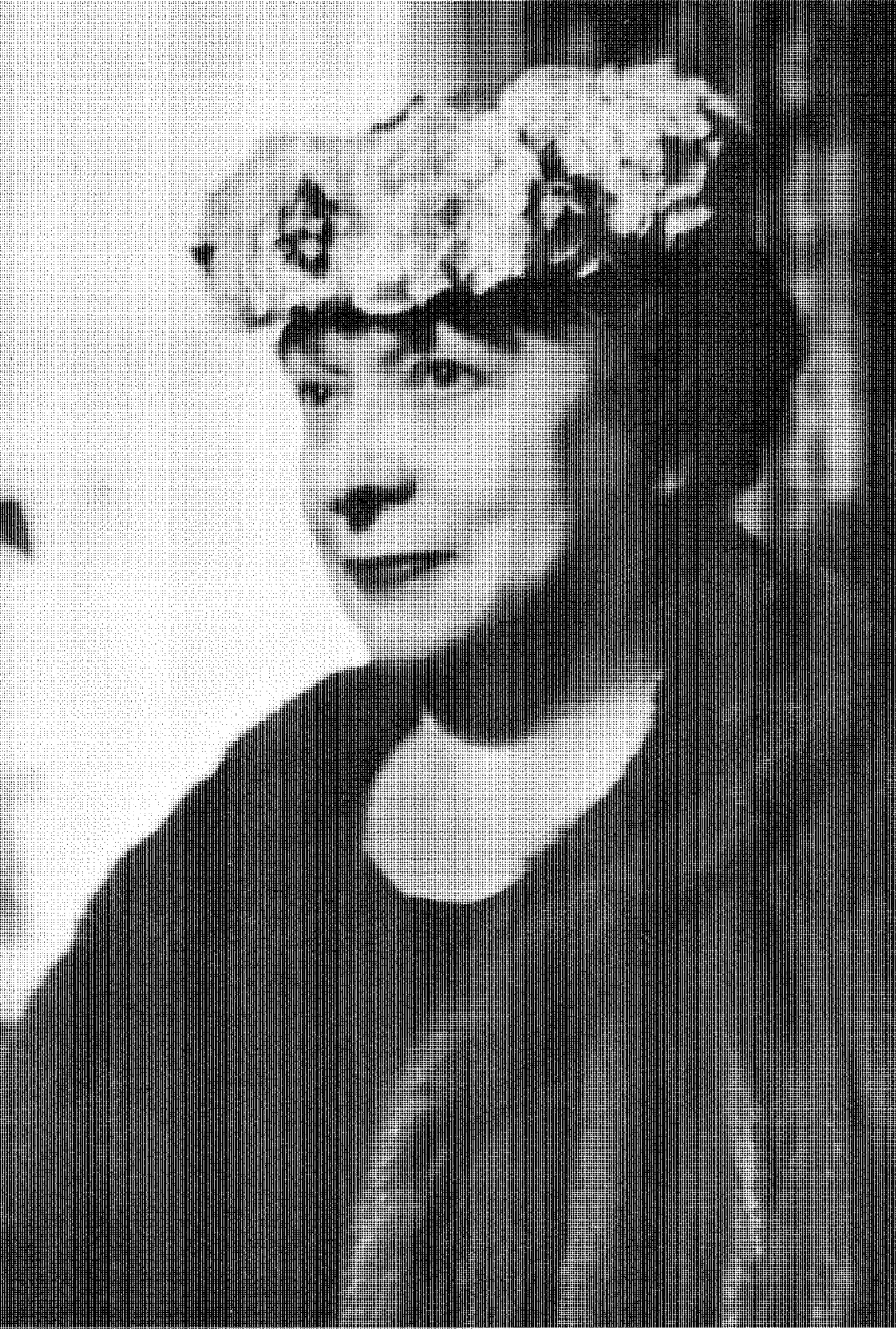
Senator Hazel Abel