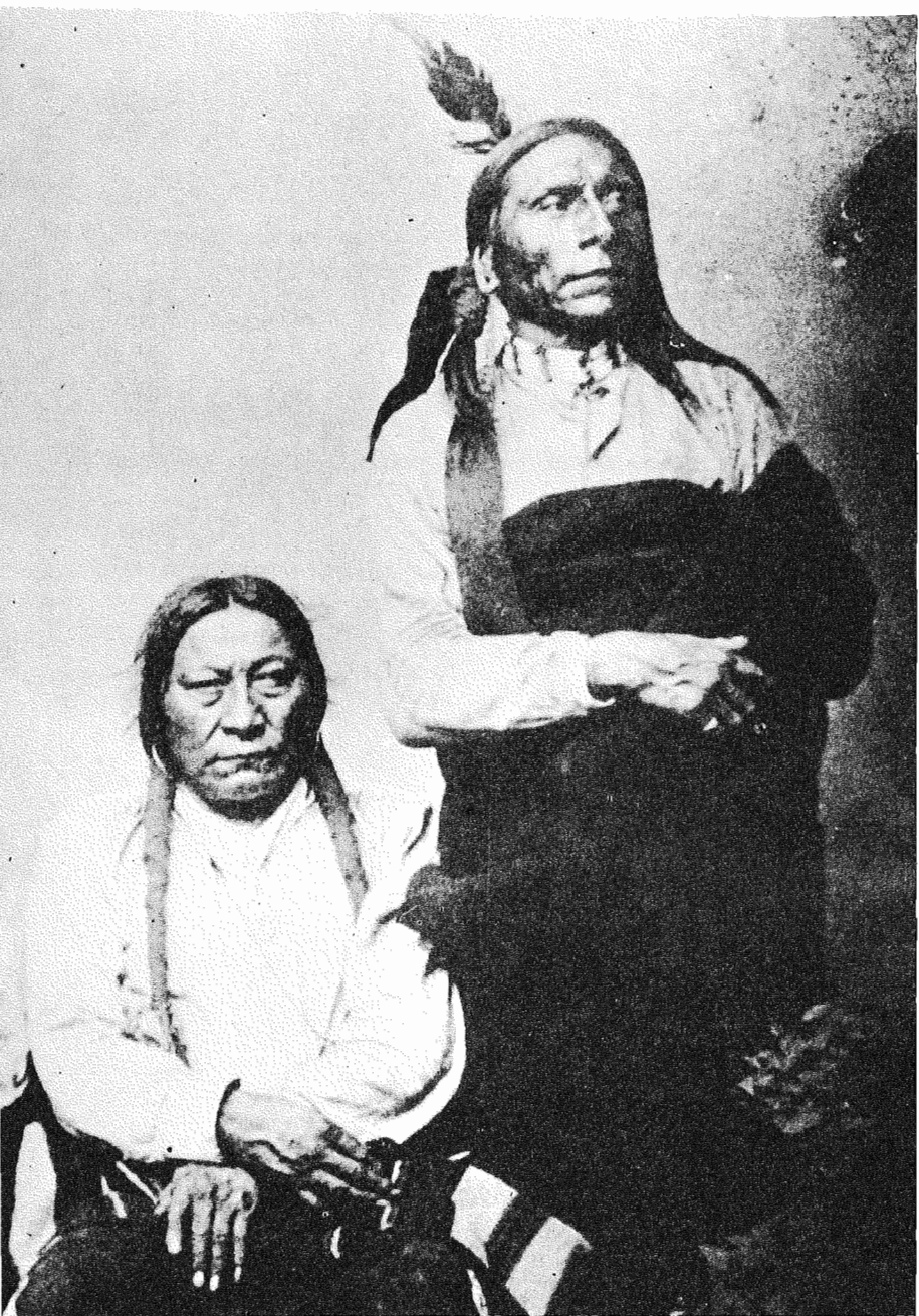
Iron Bull and Pawnee Killer.