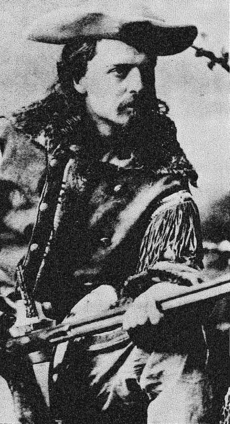
Cody was photographed in showman's garb in New York about 1873 at the beginning of his theatrical career.