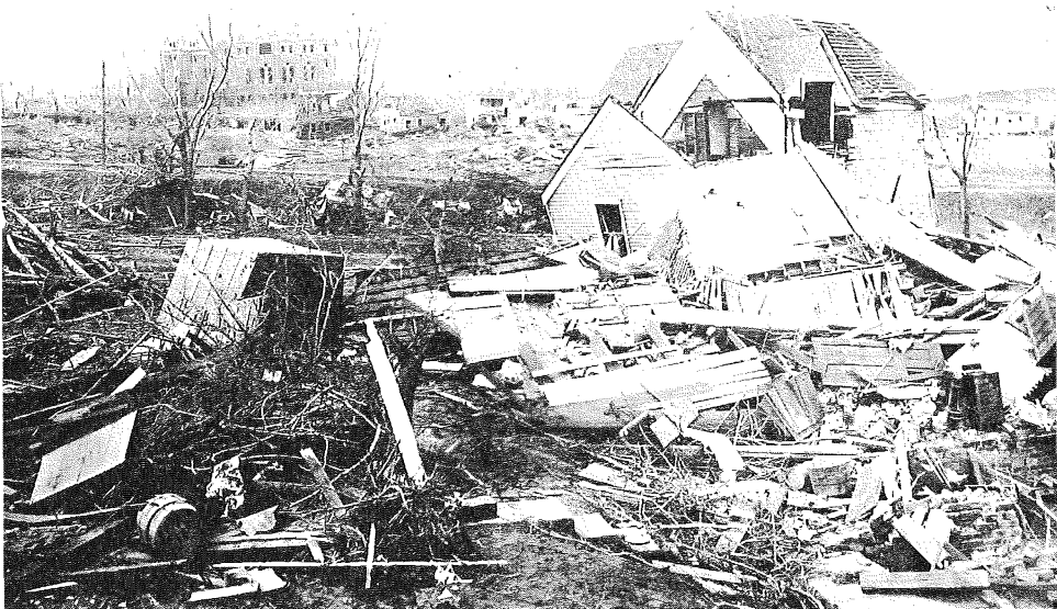
The tornado of Easter Sunday, March 23, 1913, killed 185 Omahans and destroyed hundreds of buildings.

for the widening of several streets and proposed an “inner belt” traffic way and a scenic drive along the Missouri River. 113