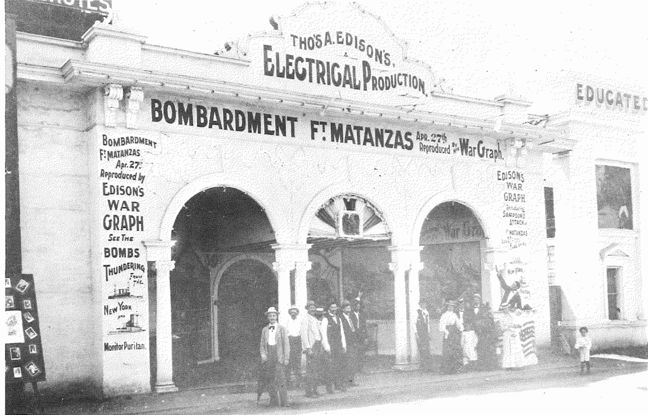
"Edison Wargraph" at the Trans-Mississippi and International Exposition in 1898 depicted the U. S. naval bombardment of Fort Matanzas, Cuba, during an engagement in the Spanish-American War.