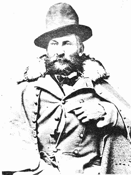
General George Crook

The result pleased Sheridan, who ordered Crook to continue dismounting and disarming Sioux at the Red Cloud Agency. If Spotted Tail, the Brule leader, resisted, he also was to be dismounted, but fortunately it was not then necessary. 27 Crook's first message also reached Sherman, who praised Crook and expressed a hope that Terry would be equally successful. 28