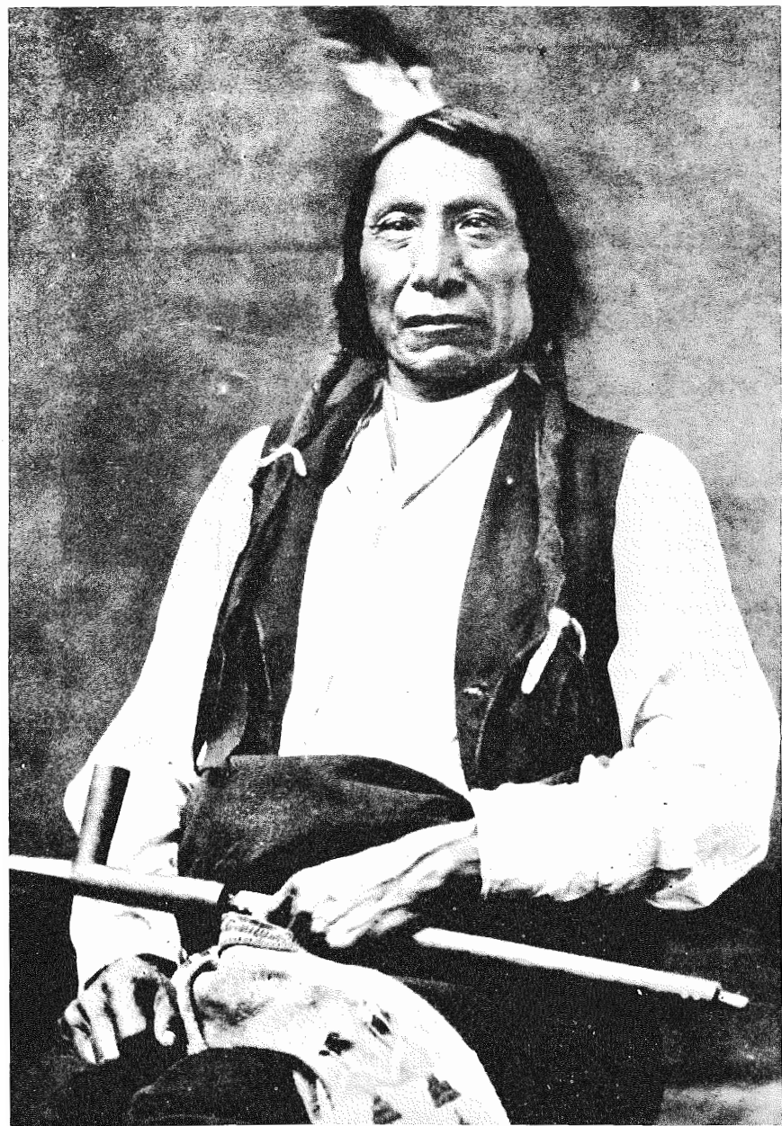
Chief Red Cloud of the Oglala Sioux