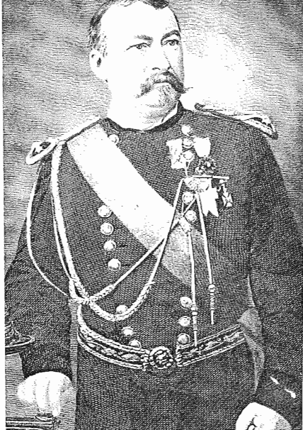
General Philip H. Sheridan