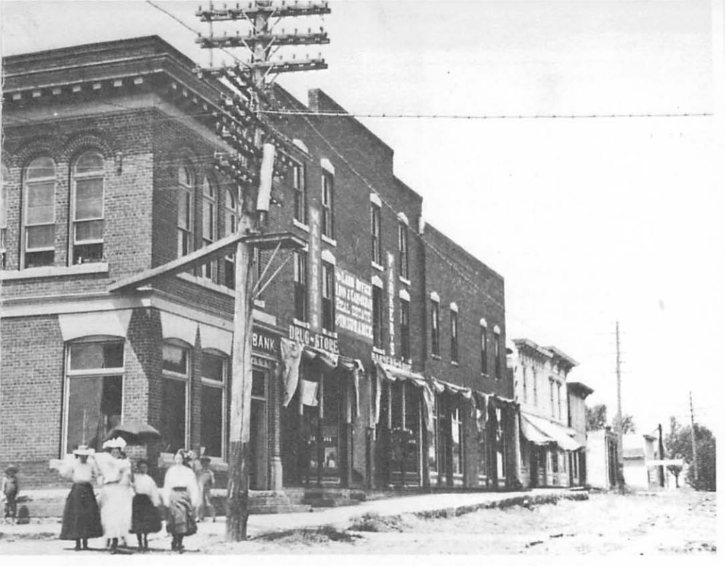
West side of square, Table Rock, about 1910. Opera house is above the drugstore.