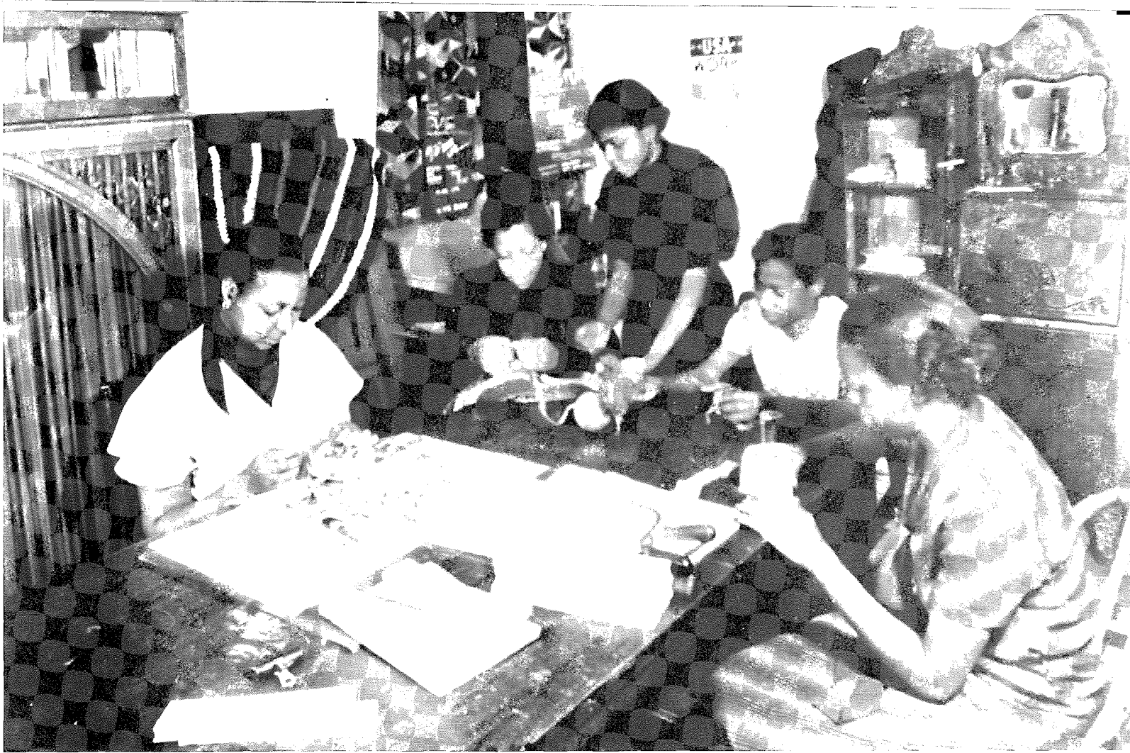
A sewing class in the Urban League building at 2001 U Street, April 17, 1936.

ated the miniscule black business community in Lincoln. All were classified as small businesses: four restaurants, two barber shops, two transfer companies, a billiard parlor, a dance house, and a recently established newspaper. They derived "their principal support from the Negro population," and their prosperity was "largely due to the fact that Negroes were barred from such establishments operated by other groups."