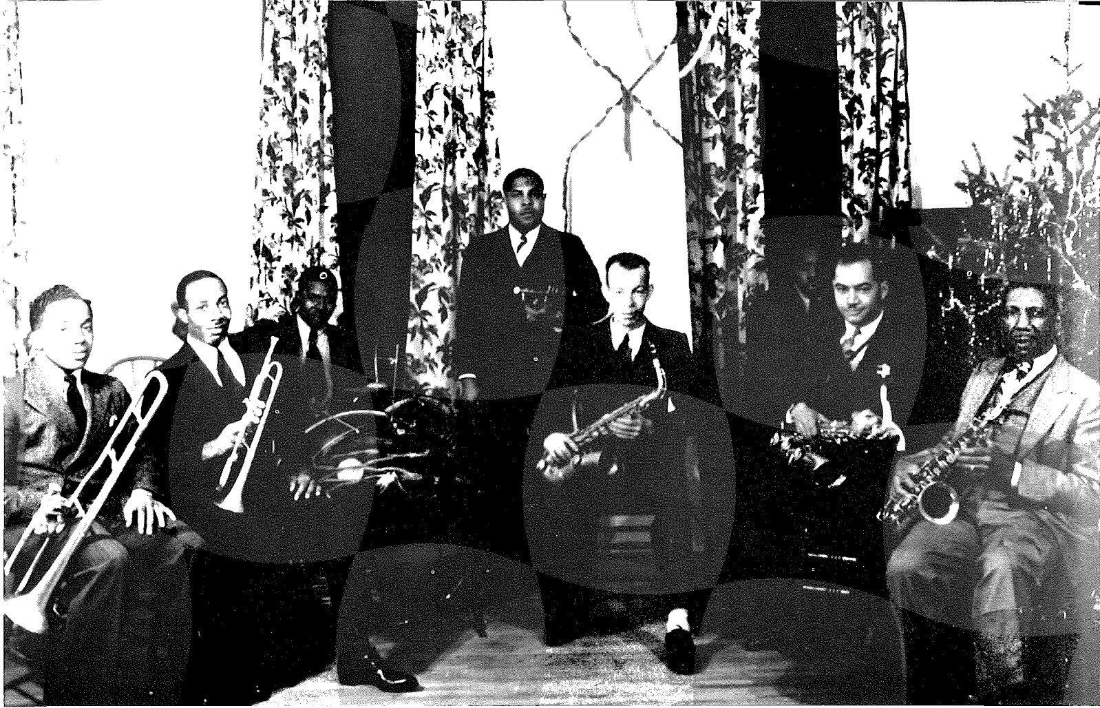
Band composed of Lincoln Urban League members.

if not impossible, demand upon resources to create separate facilities.