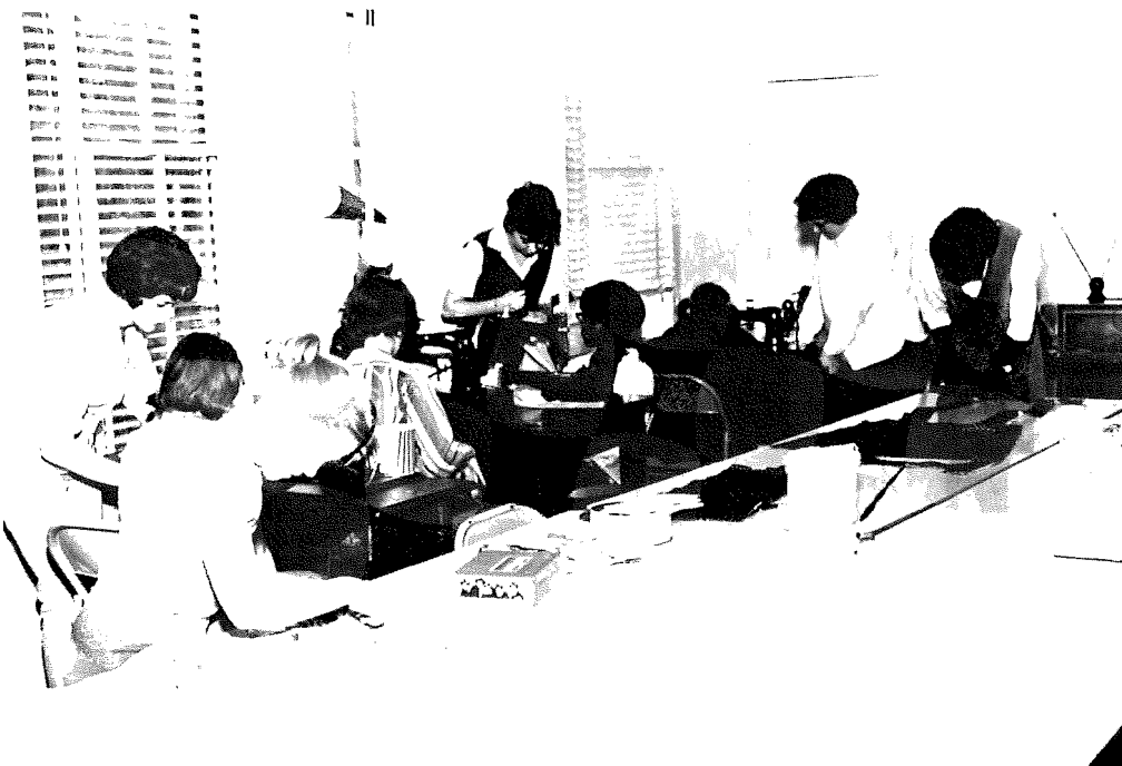
Volunteers in the kitchen (above) and a sewing class (below) in the Urban League building at 2030 T Street.

busied himself reorganizing a local NAACP chapter and backing the formation of the LUL. Local circumstances and the exigencies of the Great Depression, it seems, combined to obviate intraracial differences. 37