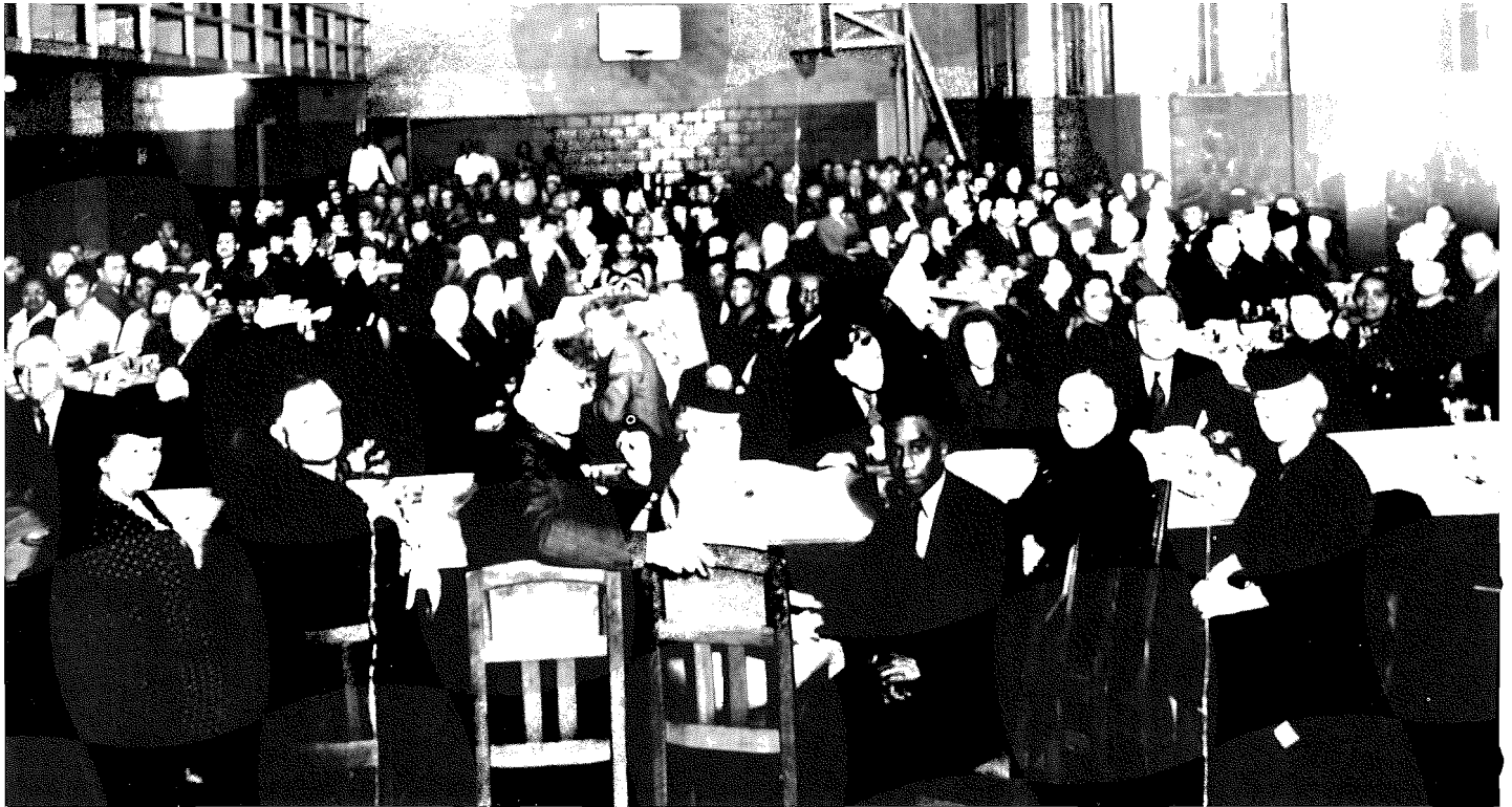
Meeting of Lincoln Urban League board of directors and members in the League building at 2030 T Street.