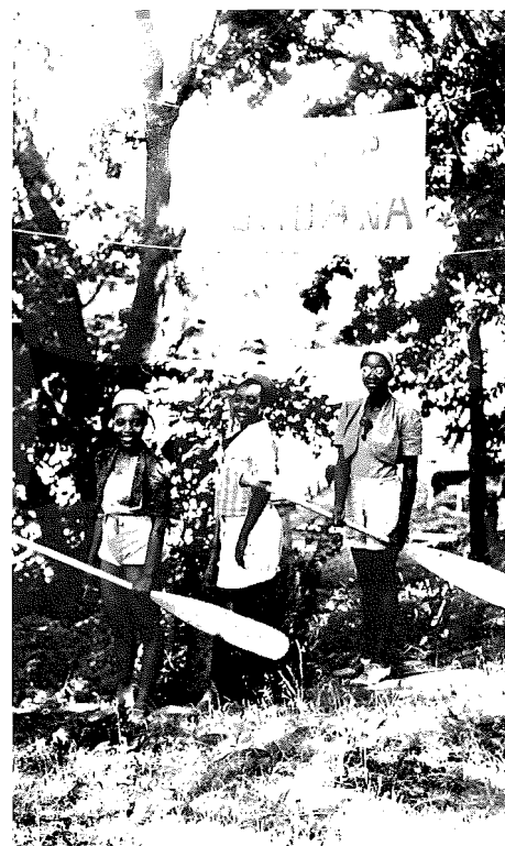
The Lincoln Urban League sponsored outings and camping activities for black teenagers. In 1945 a League camp for girls was held at a site on the Big Blue River near Crete.