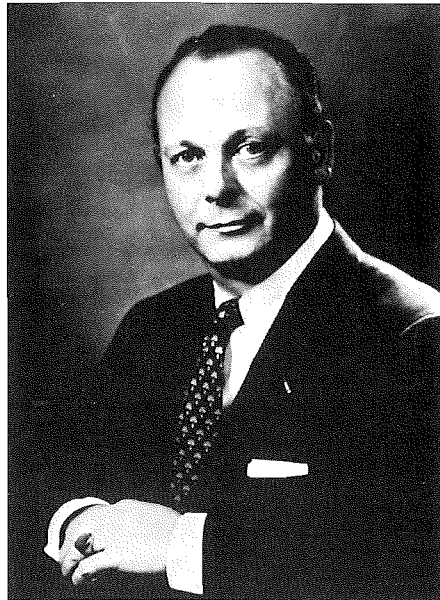
Nebraska Senator Fred Seaton cared for many personnel and scheduling details aboard the Eisenhower train.