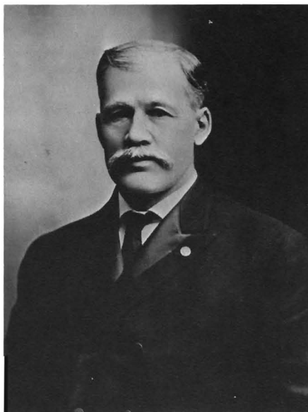
Governor John Hopwood Mickey.