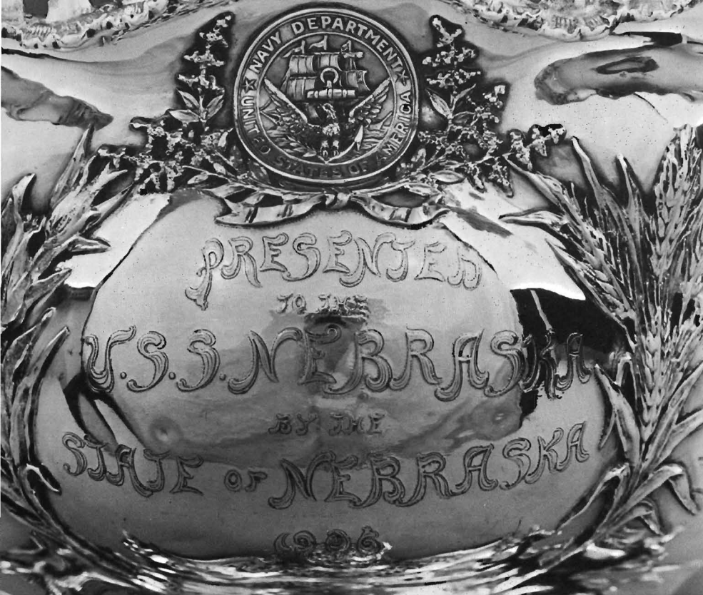
Detail of the punch bowl.