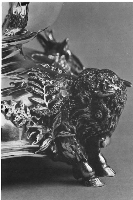
Detail of the punch bowl... (right) The handle of the ladle.