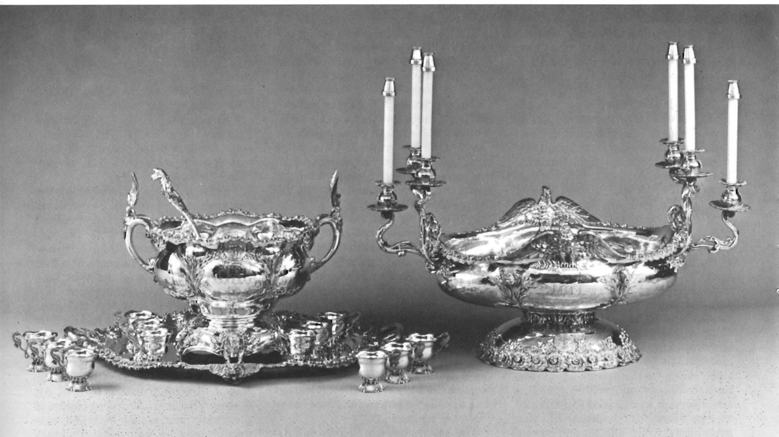
The USS Nebraska's silver service as it appears today.