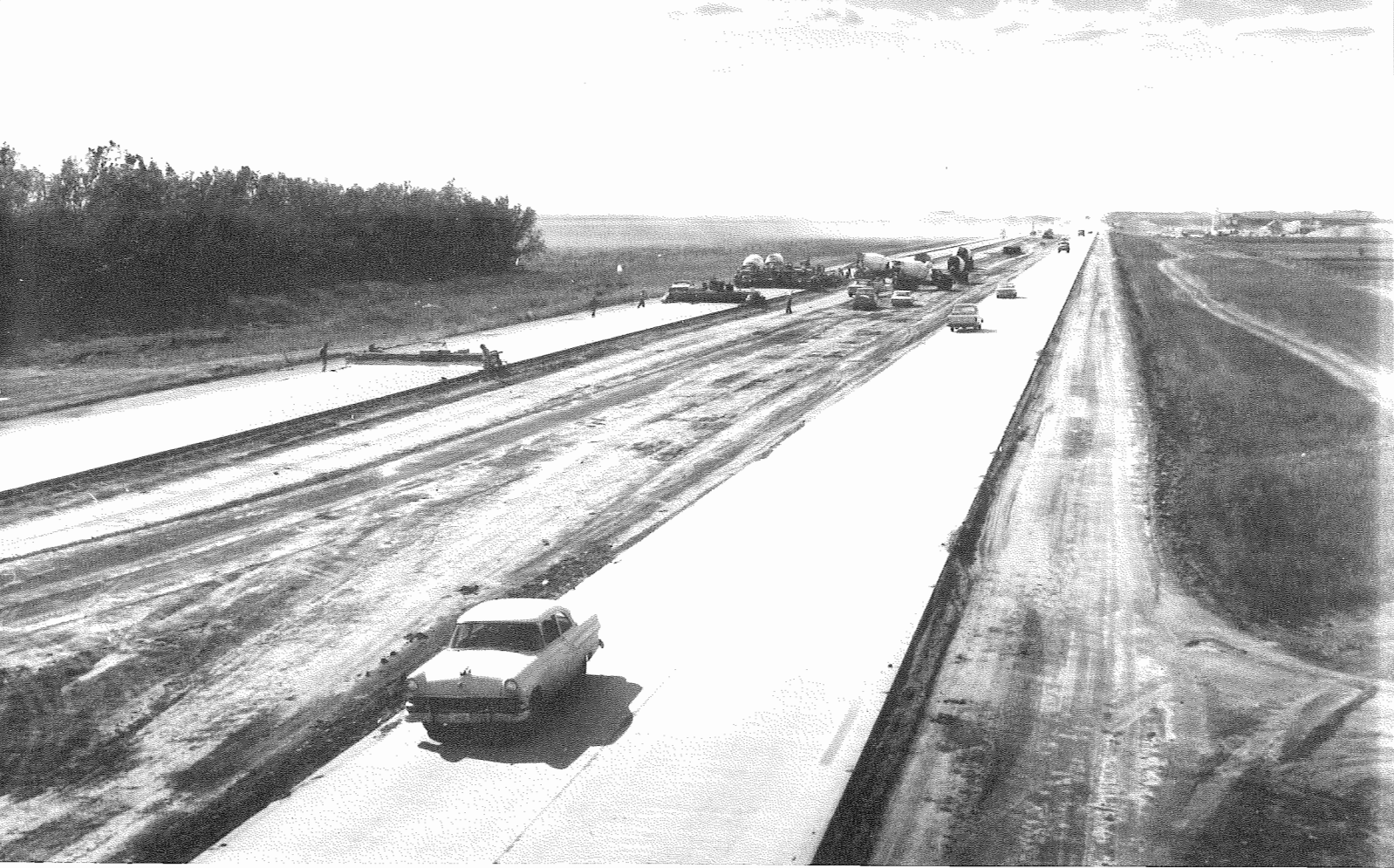
I-80 construction.