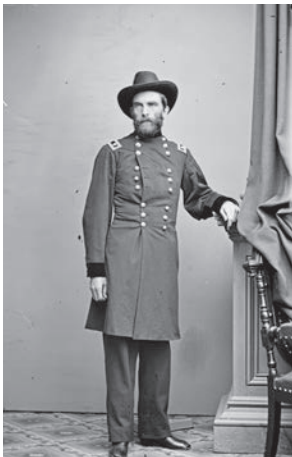
Maj. Gen. Grenville M. Dodge.

returned from a futile expedition to suspected Indian strongholds in Kansas, during which they had been on short rations and “have been compelled to do a vast amount of duty, and are thin and somewhat exhausted.” Livingston’s few mounted troops escorted the overland stagecoaches between Fort Kearny and Fort Cottonwood, requiring 132 men and horses every day, which Livingston acknowledged “is very injurious to our horses.” There were so few horses available that only dismounted guards were provided at the posts west of Fort Cottonwood and east of Fort Kearny. By May 1865, after a renewed spate of attacks in the Platte Valley, one noncommissioned officer with eight mounted enlisted men were assigned to every stage station west of Fort Kearny with orders to escort every mail coach. 17