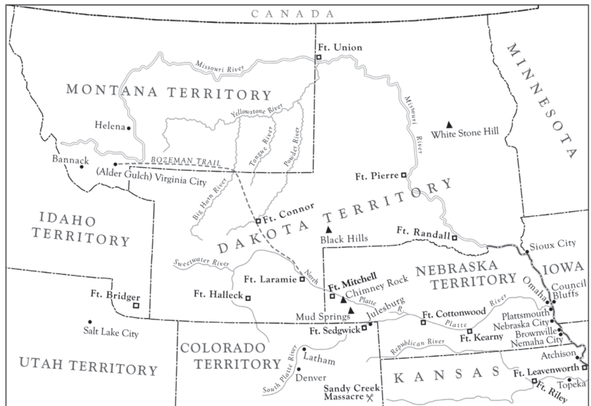
The northern Plains in 1865.

Regulations provided that the ideal cavalry horse was from 15 to 16 hands high at the withers (5 feet to 5 feet, 4 inches), five to nine years old, weighing from 750 to 1100 pounds, and "sound in all particulars . . . in full flesh and good condition." As the war with its tremendous consumption of horseflesh dragged on, the "ideal" cavalry horse became little more than an abstraction. Union cavalryman Charles Francis Adams, Jr. described how the service ruined horses. Even a walking pace of four miles an hour was "killing to horses" carrying the average load of 225 pounds comprising the soldier and his equipment. During active campaigns, said Adams, the horse remained