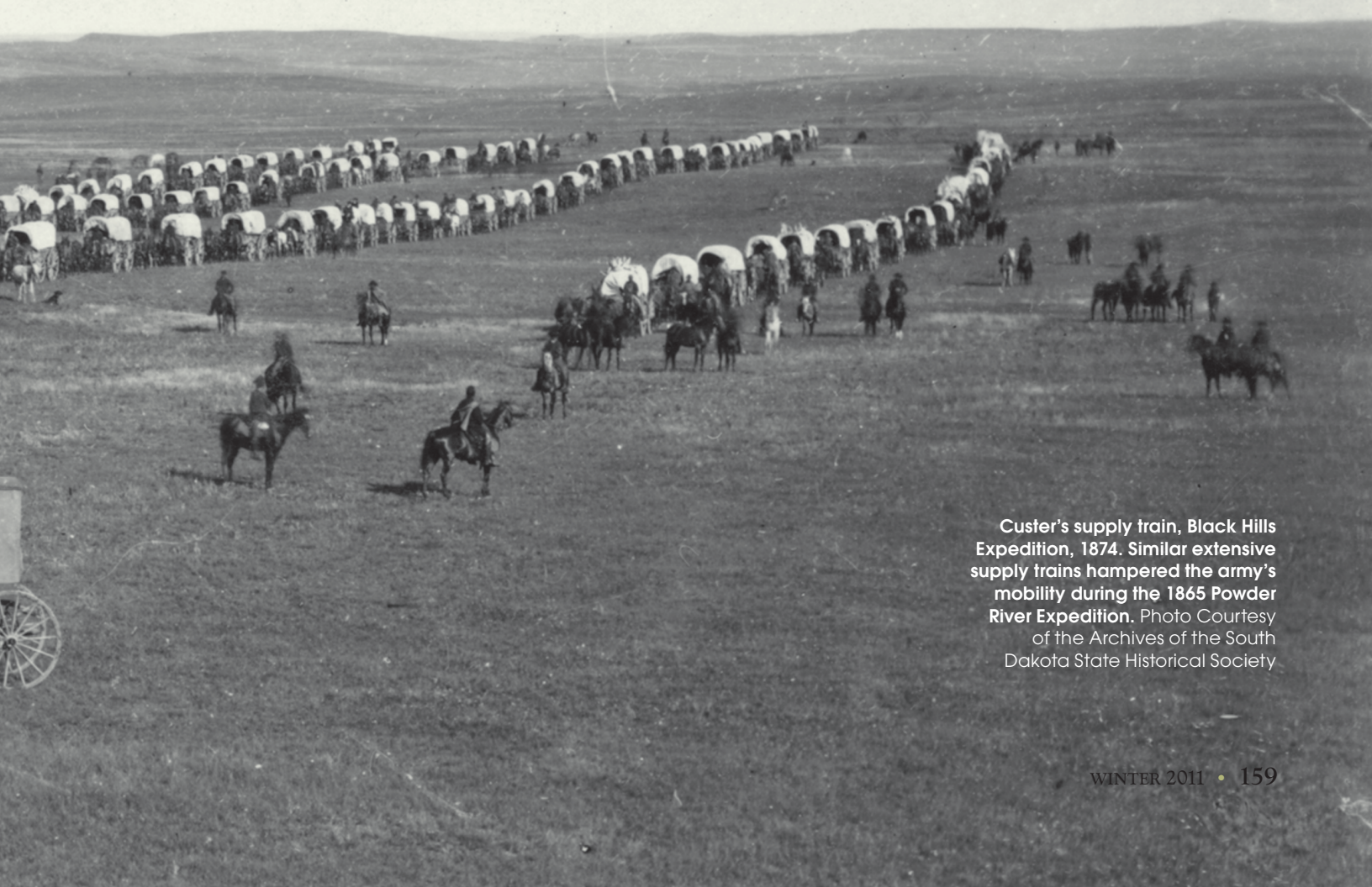
Custer's supply train, Black Hills Expedition, 1874. Similar extensive supply trains hampered the army's mobility during the 1865 Powder River Expedition.

On August 18, 1864, after hastily re-mustering at Omaha from their veteran furloughs, the men of the First Nebraska Volunteer Cavalry left for Fort Kearny. Instead of returning to Arkansas where it had spent the first half of 1864, the regiment's new mission was to help defend the Platte Valley freighting, stagecoach, and telegraph route from an onslaught of Indian raids that had recently broken out. 1 Having been issued only sixty horses for three hundred men, the mostly dismounted cavalrymen probably appreciated the irony of being sent off on foot to chase down an elusive foe known for its horsemanship. A month later the First Nebraska's Lt. Col. William Baumer notified District of Nebraska headquarters in Omaha that five companies of the regiment at Fort Kearny and at Plum Creek Station, thirty-five miles to the west, were still without horses. 2