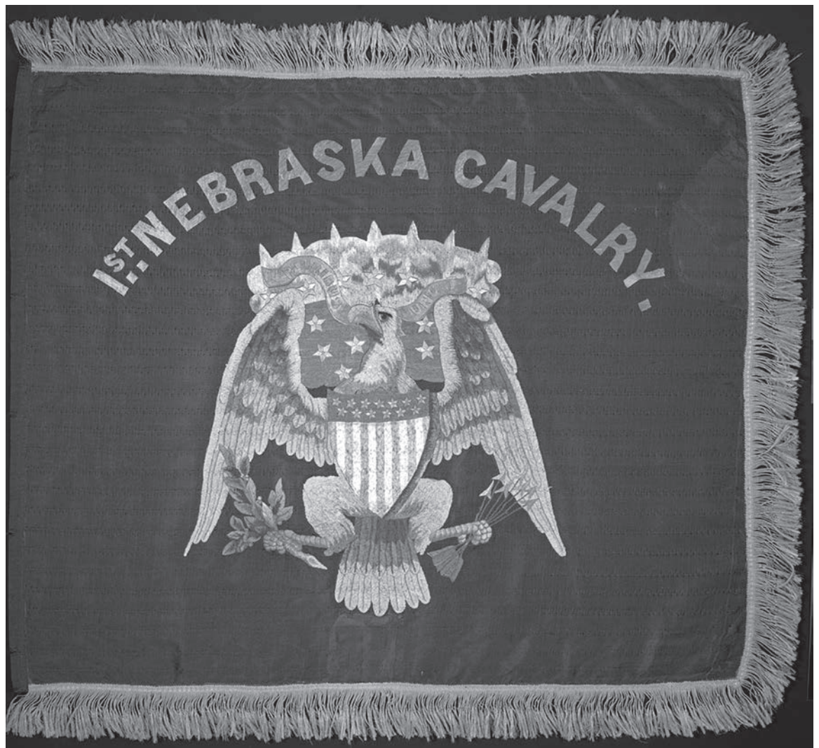
The flag of the First Nebraska Veteran Volunteer Cavalry, about 1866. NSHS Museum Collections 24272

from western governors, legislatures, and military officers became too loud to ignore or when the Indians actually halted the mail coaches and tore up the telegraph line—it had a hazy grasp of what it took to conduct effective military operations across an unpopulated region nearly the size of the Confederacy with no railroads, few navigable waterways, and an often barren landscape. When Union victory in the spring of 1865 finally freed up more troops and resources, pressure from long-serving volunteers and state officials for their discharge, along with the war's staggering cost, led the War Department to rapidly demobilize the Union army and slash expenditures with little regard for the needs of the commands still fighting Indians in the West. By mid-summer 1865 the more than one-million-man Union army of that spring had already been reduced by 641,000 men; by October, the quartermaster's department had sold