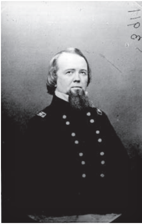
Maj. Gen. John Pope. Best remembered for his defeat at the Second Battle of Bull Run, August 28-30, 1862, he spent the remainder of the Civil War in the West.