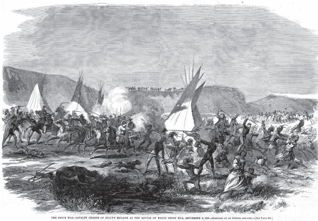
"Cavalry Charge of Sully's Brigade at the Battle of White Stone Hill, September 3, 1863," Harper's Weekly , October 31, 1863

saddled an average of fifteen hours per day. "His feed is nominally ten pounds of grain a day and, in reality, he averages about eight pounds. He has no hay and only such other feed as he can pick up during halts. The usual water he drinks is brook water, so muddy by the passage of the column as to be of the color of chocolate. Of course sore backs are our greatest trouble." Nonetheless, the horse "still has to be ridden until he lays down in sheer suffering under the saddle." Adams was describing conditions in northern Virginia in 1863, not those facing the cavalry on the distant Plains, with even fewer resources to call upon. 6