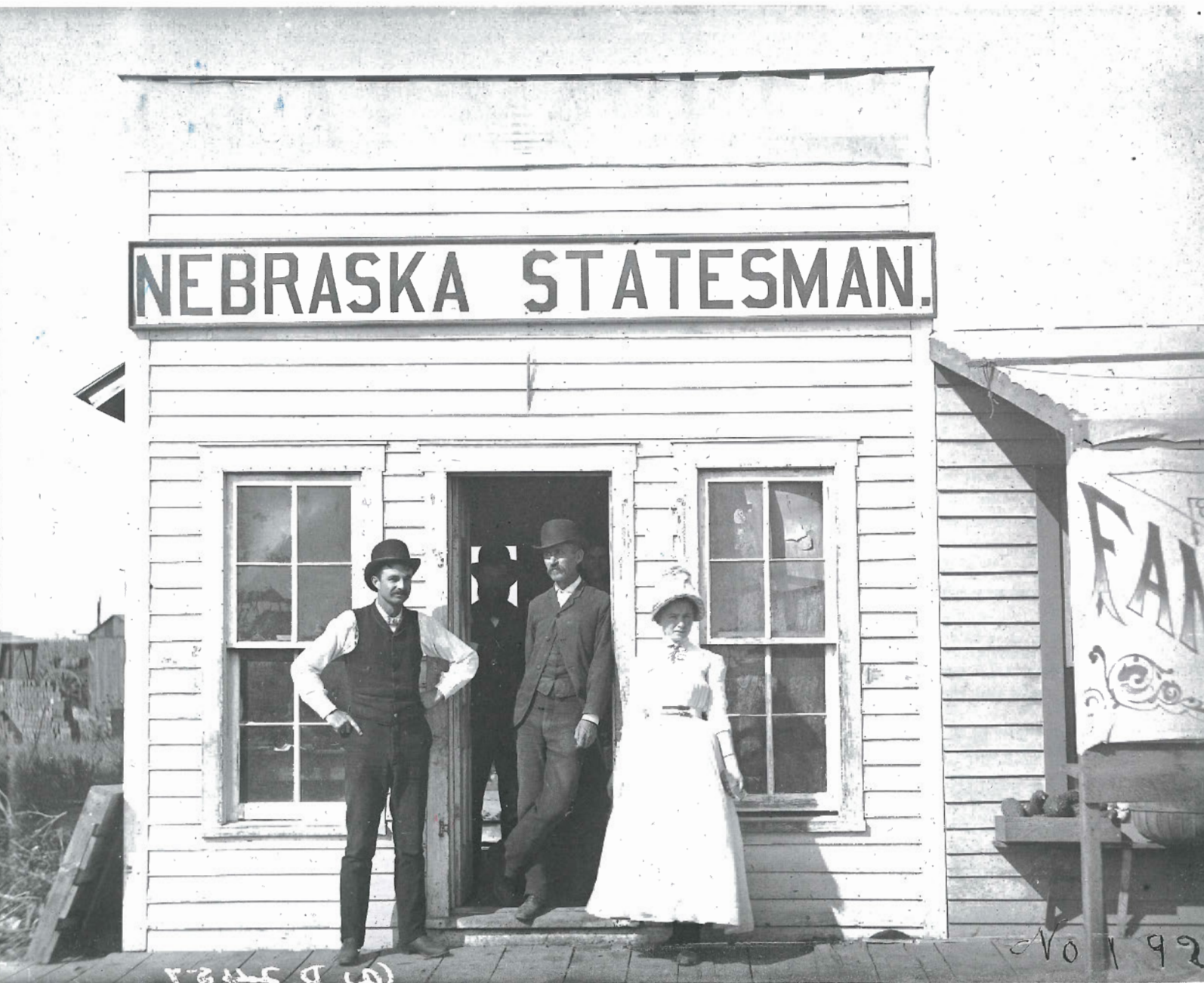
The Nebraska Statesman , Broken Bow, Nebraska, 1886. NSHS RG2608-2457a