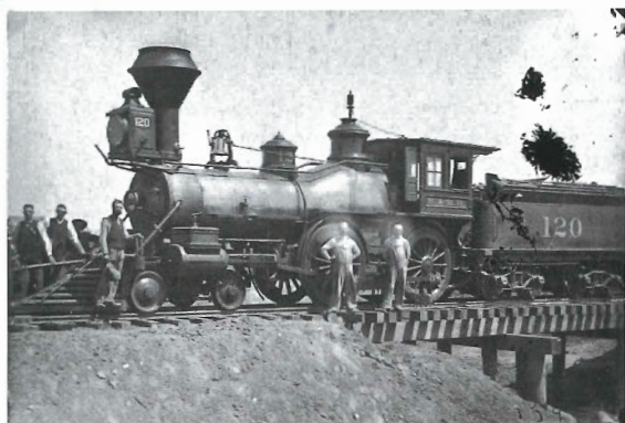
The first train to arrive in Broken Bow in 1886.