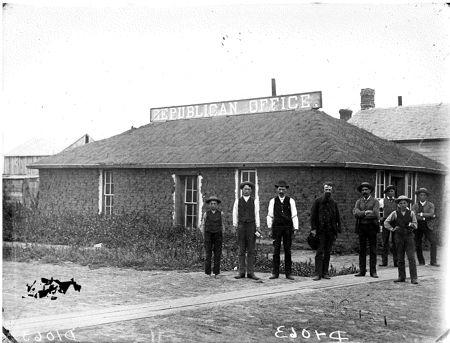
The Custer County Republican was another of the Statesman's rival newspapers in Broken Bow.

work and narrowly escaped a lynch mob. Information published shortly thereafter in the Nebraska press about the incident indicated that similar charges had prompted his abrupt 1891 departure from Broken Bow. 9