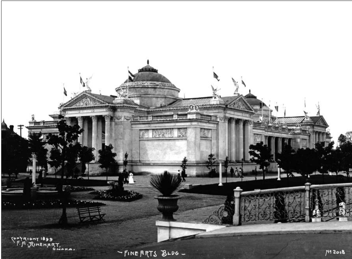
The Fine Arts Building, built for the Trans-Mississippi and International Exposition in Omaha, 1898. The buildings at the exposition were temporary structures made of plaster and lath.

meet in Omaha in 1895. At their Omaha meeting in November that year, delegates resolved to support numerous environmental projects in the West, such as a survey of the region's arid lands for possible irrigation, protection of its forests, navigation in its rivers, and another Populist issue—free coinage of silver. They also agreed to promote the region with an exposition, and Omahans touted their city as the best site. 121