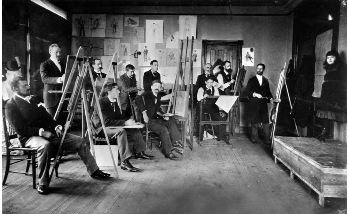
An Omaha art class, circa 1894.