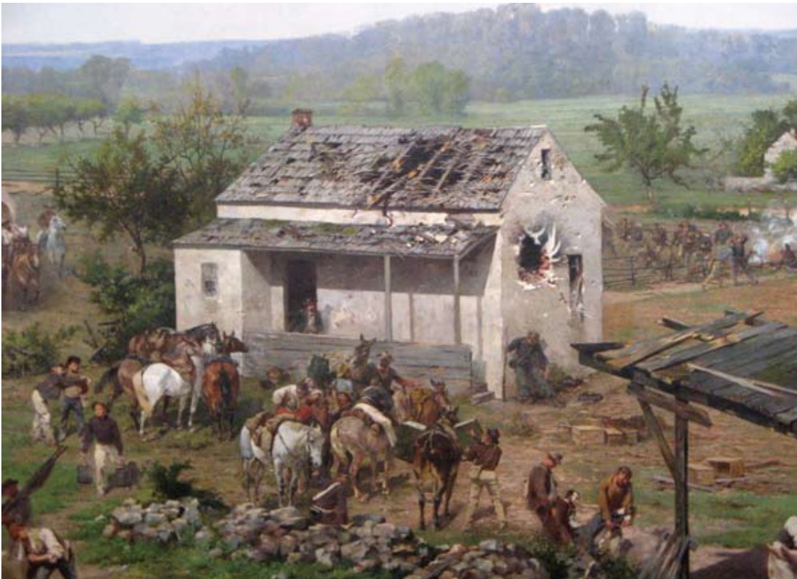
Detail of The Battle of Gettysburg , a panorama by Paul Philippoteaux. Starting in 1886, a full-size copy of the 400-foot-long painting was displayed in a specially constructed building in Omaha. The restored original is displayed in Gettysburg, Pennsylvania.

The economy did not improve, and 1893 was an economic fiasco. In January, a Lincoln bank failed, and by mid-year, the local elite were chiding residents not to “invite disaster by the withdrawal from the solvent institutions of money the depositor cannot possible use.” 107 Local businesses reduced the size of their operations, and the bonds offered for sale by the city to fund its needed infrastructure projects “went begging.” 108 Omaha’s smelting works prepared to shut down due to the lack of a demand for silver. 109 Statewide, many Nebraska farmers packed up their few belongings and headed back East, “getting away from the prairie farms where long term and continued drought, crop failure, and mounting mortgages had made it impossible for them to live.” The population in the western part of the state experienced a famine that necessitated the charitable relief efforts undertaken by eastern Nebraska philanthropists. 110 Despite its economic difficulties, a December 1893 report