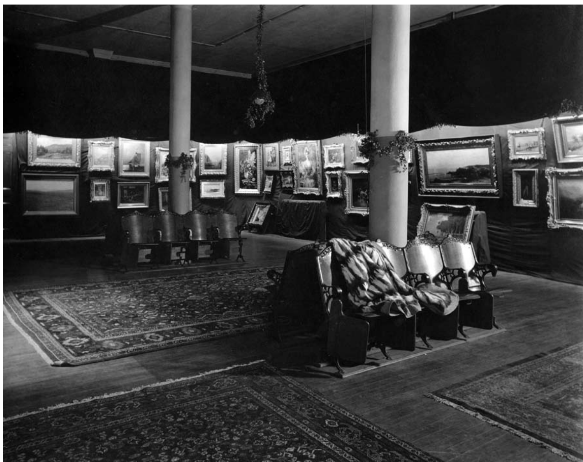
A late-nineteenth century Omaha art gallery.

The precise opening date for the local artists' first show in late 1888 remained undecided well into the fall due to delays in construction of the art gallery at Lininger's home. However, when it finally opened on November 15, 1888, the first exhibit of the Western Art Association included some 350 pieces of art, china painting, and architectural renderings. Artists from as far away as Detroit participated. A local reviewer noted effusively that the exhibit did "credit of a high degree to the northwest in general and the city of Omaha in particular." The exhibit site, Lininger Gallery, was itself a work of art. Designed by the local architectural firm of Mendelssohn, Fisher and Lawrie, the gallery cost $15,000 to construct. The sixty-by-thirty-foot structure, built of brick and terra cotta in the Italian Renaissance style, had walls fourteen feet high. The interior of marble wainscoting with mahogany and bronze trim and a tile floor was lit solely by natural light with skylights measuring fourteen feet by forty-four feet. The exterior boasted a roof of red Spanish tile and niches in the walls for statuary. 59