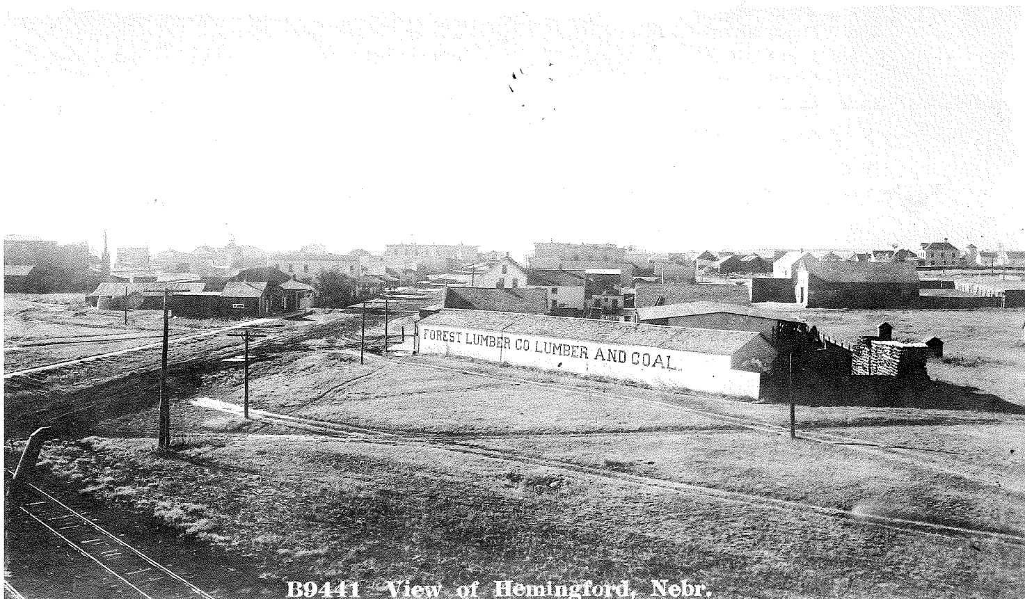
B9441 View of Hemingford, Nebr.

Hemingford, Nebraska, undated. NSHS RG2956-32