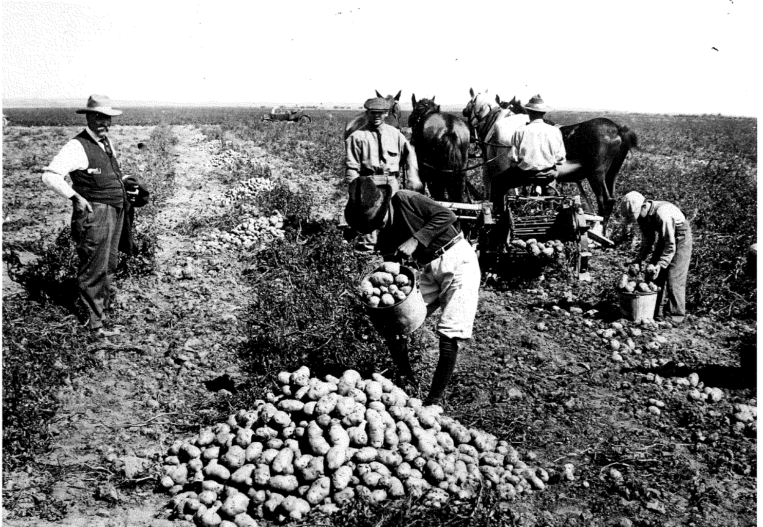
Harvesting southeast of Alliance.

Despite such prejudices, growers quickly realized the value of the Lakota farm laborers. However, "The agency [Pine Ridge Agency] will not permit them to come on an individual application so they have to be procured through