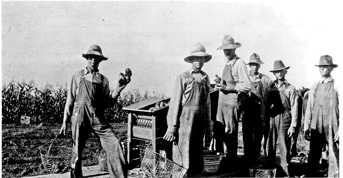
Right: Sorting potatoes near Alliance in 1922.