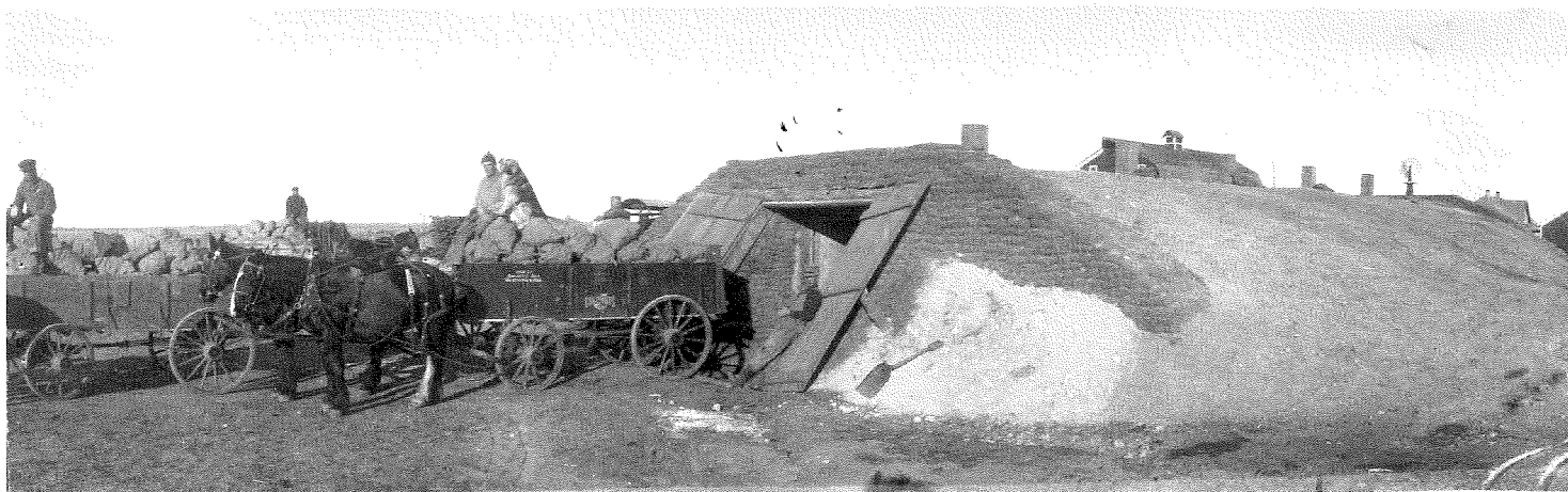
A potato cellar in Box Butte County, 1917. NSHS RG3152-3

the new campsite was next to a septic tank and had no water on site, forcing women to walk to a house for water. The Lakotas were especially displeased that the site lacked forage for their horses. Alliance had failed to live up to its reputation for hospitality, which broke kinship obligations and revealed that a few residents were becoming openly prejudiced toward Lakotas. 32