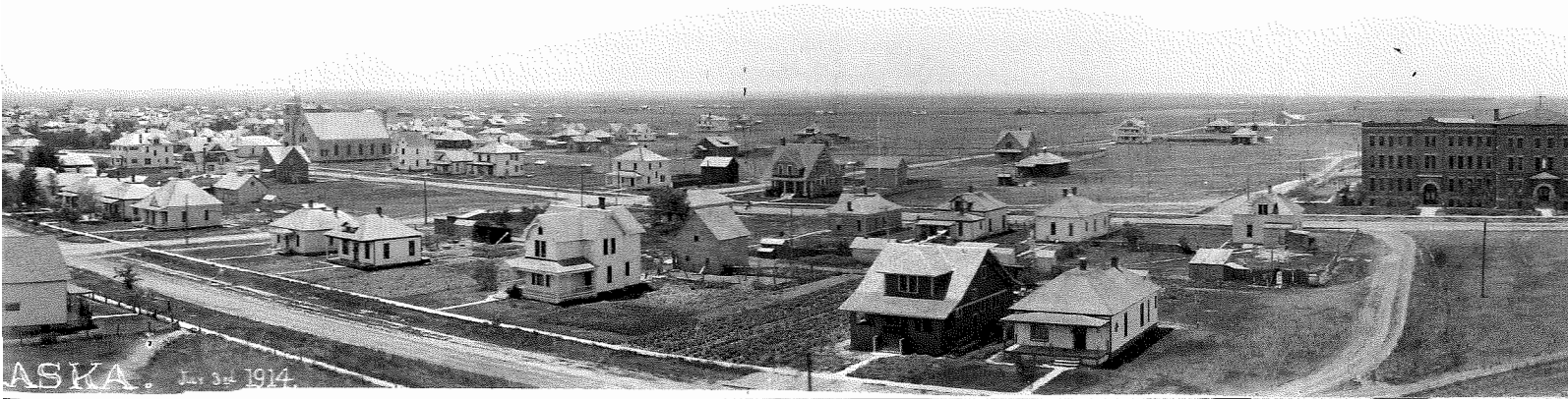
Alliance, Nebraska, 1914.

At the time, the U.S. government strictly regulated and frowned on such public practices of traditional Indian culture. Yet, the Oglalas danced to resist assimilation pressures and maintain cultural values. 24 Residents and growers came to express appreciation and witness what they assumed was a vanishing culture; they did not see Lakota participation in wage labor as an adaptation to modern society that allowed them to reaffirm traditional cultural practices.