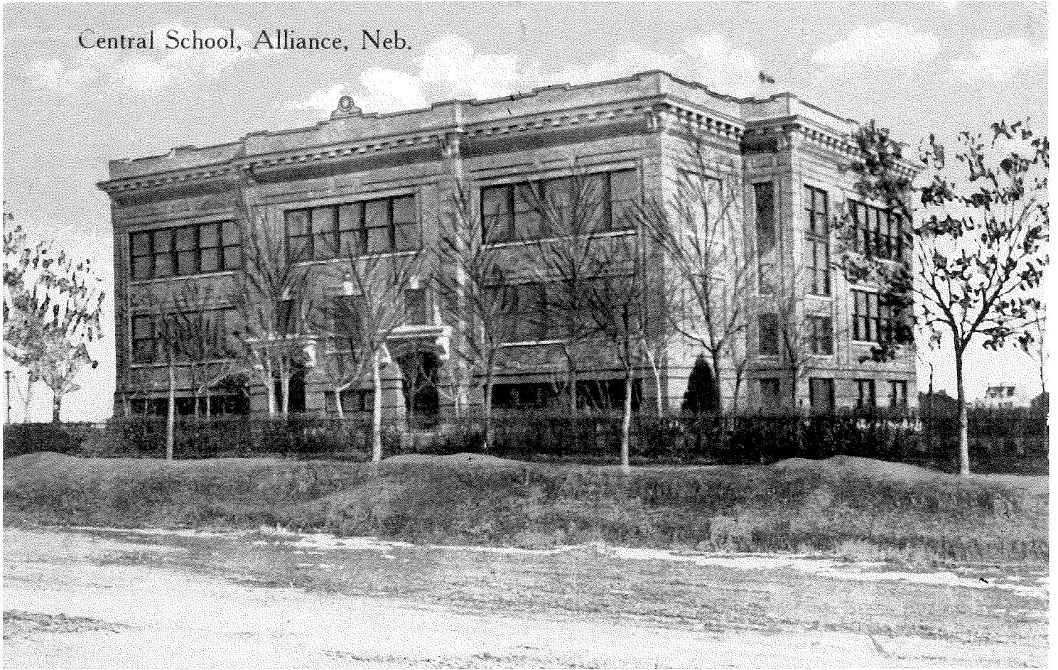
Central School, Alliance, Neb.

A proposed 1948 contract required farmers to arrange public school enrollment for Lakota children whose parents worked for more than three weeks.