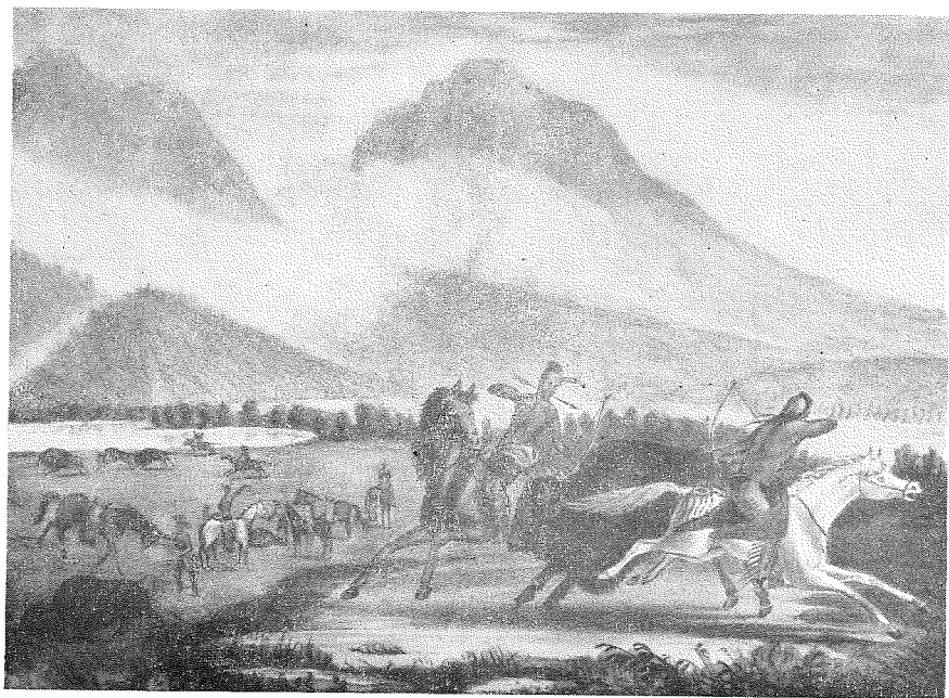
Fig. 2. "Buffaloe Hunt on the River Platte." From J. O. Lewis, Aboriginal Port Folio , courtesy Indiana Historical Society.