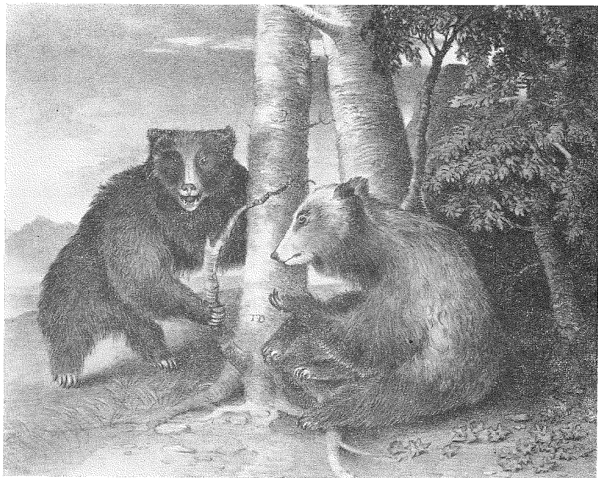
Fig. 5. Grizzly Bears. Lithography after a drawing by T. R. Peale.