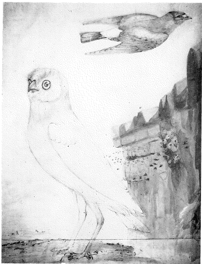
Fig. 3. Cliff Swallows. Drawing by T. R. Peale, from the Lawson Scrapbooks, courtesy Academy of Natural Science, Philadelphia.