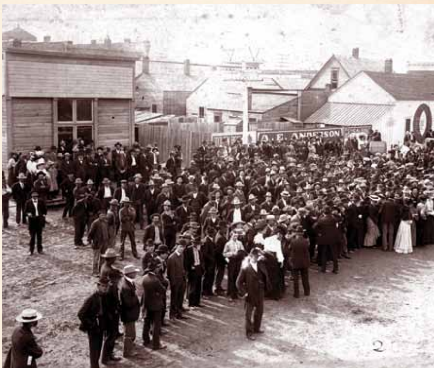
Crowd near Custer County land office, 1904.

In Nebraska at least, the greatest flourish of songs responding to the human consequences of the Homestead Act occurred between August and November of 1890. These can be broadly classified as political songs (either campaign or protest or both), and typically dealt with persons and issues important to that year’s election. However, these are not the homesteading songs that were most