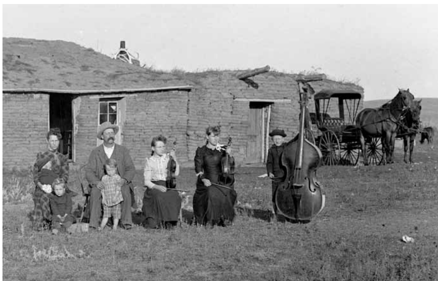
Southwest Custer County, 1892. (detail)

of the homesteading experience are those I call laments. These songs bemoan the plight of the struggling sod-house settler, but almost always do so with a dose of tongue-in-cheek humor. They seldom have the bitterness or the anger of the political songs. Three of these—“Dakota Land,” “The Lane County Bachelor” (also known as “Starving to Death on a Government Claim”), and “The Little Old Sod Shanty on the Claim”—appear in all the standard folk song collections on which this article draws. They express themes common to homesteading laments: the harshness and changeability of weather, the lack of basic necessities, and the short supply of marriageable women. “Dakota Land” (also known as “Kansas Land,” “Nebraska