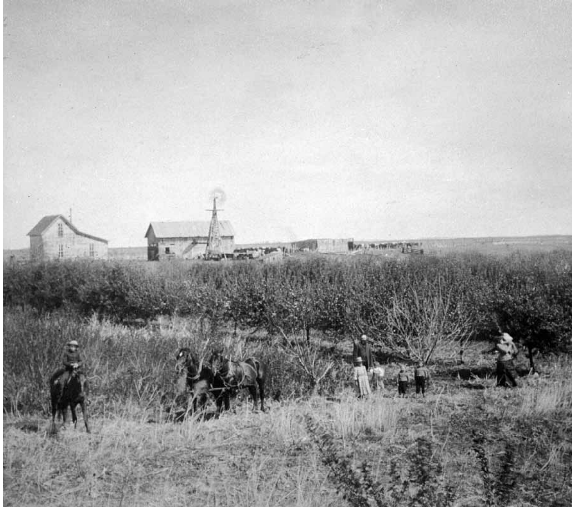
James and Luna Kellie's homestead, Kearney County, 1890.

plains states were complicated by a multitude of factors. Among other challenges they faced tough prairie sod which required a different kind of farming than soils farther east, natural disasters such as the grasshopper plagues of the 1870s, the seemingly endless dry years of the early 1890s, and often a pronounced lack of capital. 43 When these uncontrollable variables were coupled with manmade roadblocks such as high rates for freighting and farm loans, the voices in homesteading songs changed to reflect the homesteaders' metastasizing frustrations.