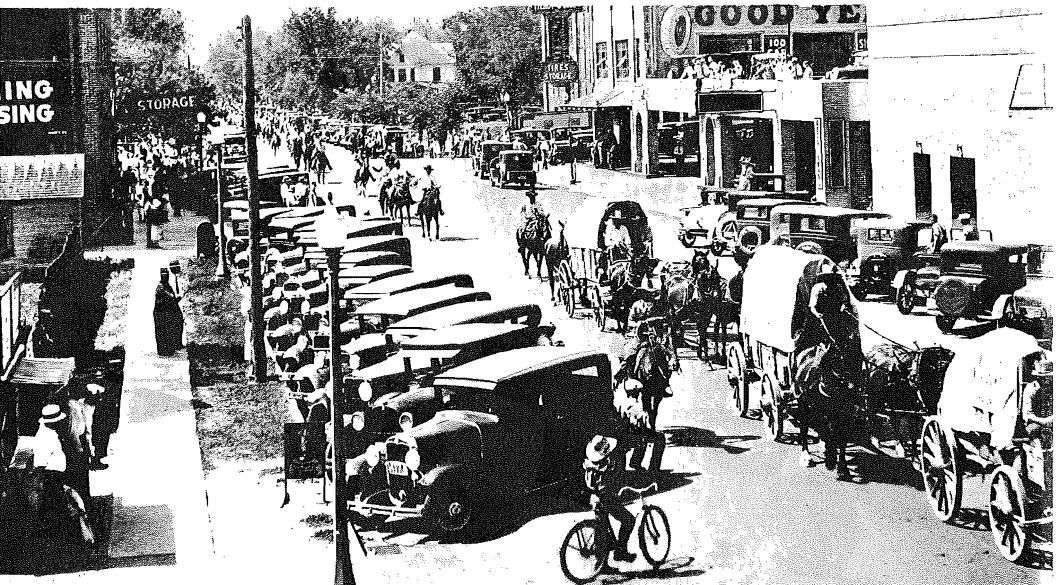
North Platte, 1932, including roundup parade.