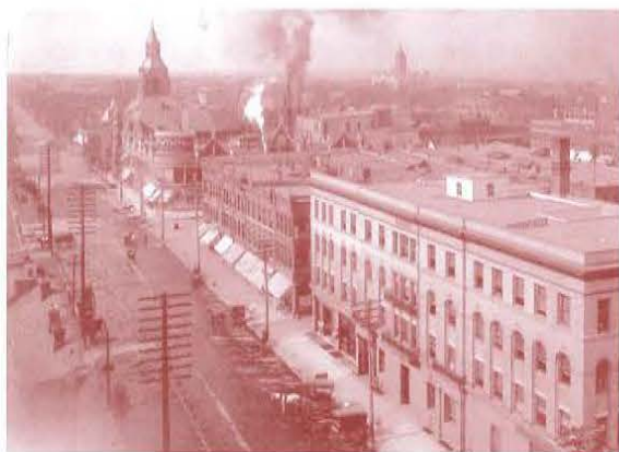
Twelfth Street looking south from O Street. Red Ribboners once met near here on south Twelfth.