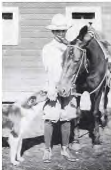
Spangler Arlington Brugh (Robert Taylor) with his pony "Gypsy" about 1923 at the Isaac Jamison farm southeast of Ellis.

to Filley, where Brugh resumed work at the Stanhope elevator. 9