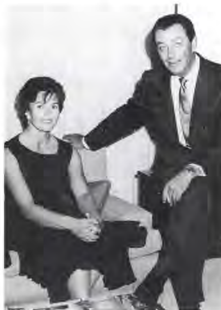
Ursula Thiess Taylor and Robert Taylor on October 25, 1963, at Doane College in Crete.

Taylor helped Doane College begin a developmental campaign to raise five million dollars in October 1963 and received the honorary degree of Doctor of Humane