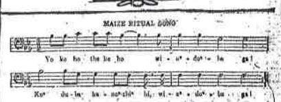
MAIZE RITUAL SONG

Ye ku ho, the lo, ho, wi - u - a - do - la, ga!