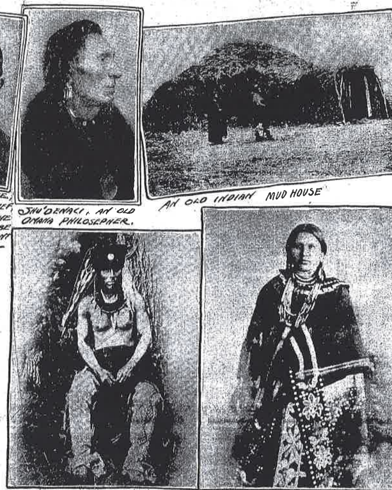
DRESS UP COSTUMES WORN BY MEN AND WOMEN

The first agriculture in Nebraska was in a primitive, primitive way. In the days of the first agriculture, the Indian was in a primitive, primitive way. In the days of the first agriculture, the Indian was in a primitive, primitive way.