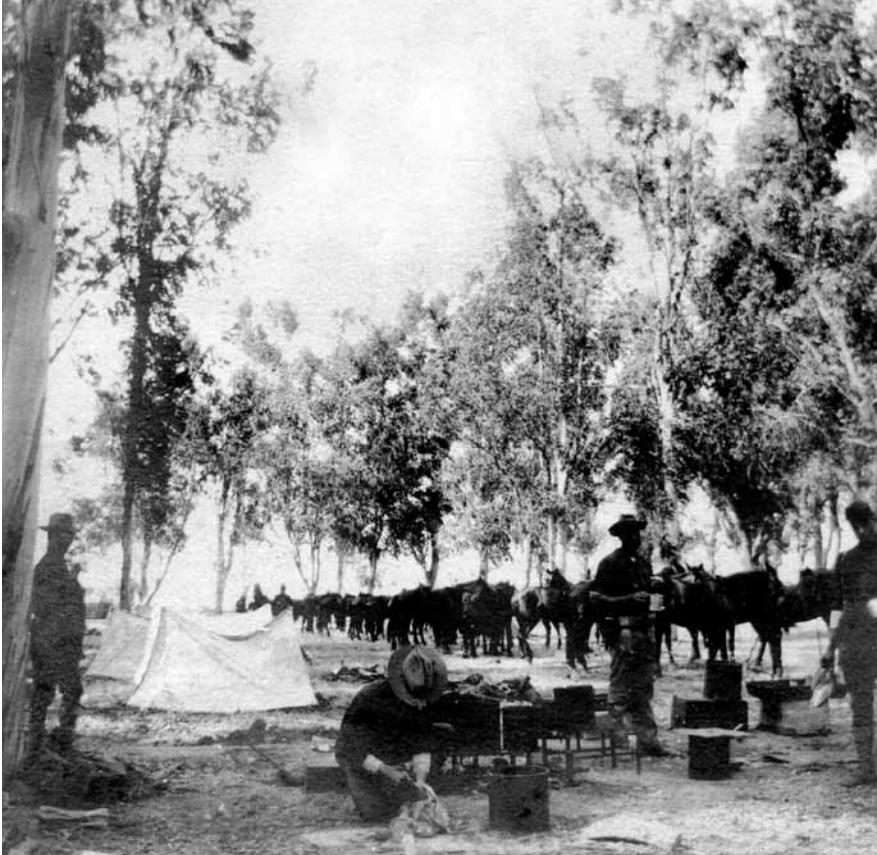
A photograph belonging to Charles Young showing a cavalry encampment, likely en route to Sequoia National Park in 1903.