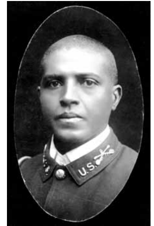
Lt. Charles Young graduated from West Point in 1889 and joined his Ninth Cavalry unit at Fort Robinson. Young went on to a long and distinguished career, eventually attaining the rank of colonel.

By 1890 the serious troubles with the Plains Indians were over, so the soldiers of the black regular