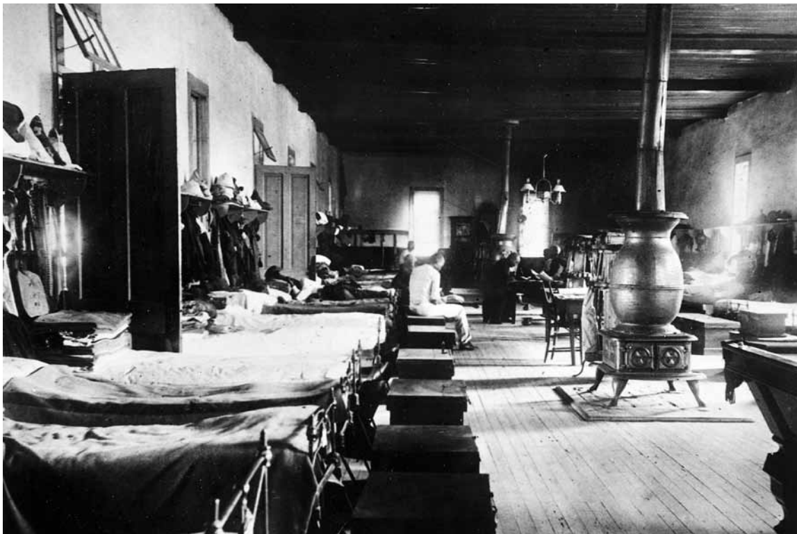
Interior of an 1887 adobe barracks at Fort Robinson. The all-black Ninth Cavalry lived in buildings that were identical to those of their counterparts in the all-white Eighth Infantry.