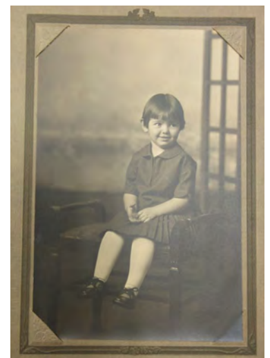
A common example that most people have in their family collections, is a silver-gelatin print on paper.

Knowing the basic structure of a photograph helps to better understand why they are such delicate artifacts. The composition of photographs can be divided into three different parts, or materials: a support base, an emulsion, and the image material. The support is commonly paper but may also be glass, plastic film, metal, or resin-coated paper. The emulsion, or binder layer, holds the final image material to the support; it is most commonly gelatin but may also be albumen or collodion. The image material can be made of silver, color dyes, or pigment particles suspended in the emulsion layer. Each of these layers can react differently to environmental fluctuations and structural damages, which make photographs very complex paper-based items.