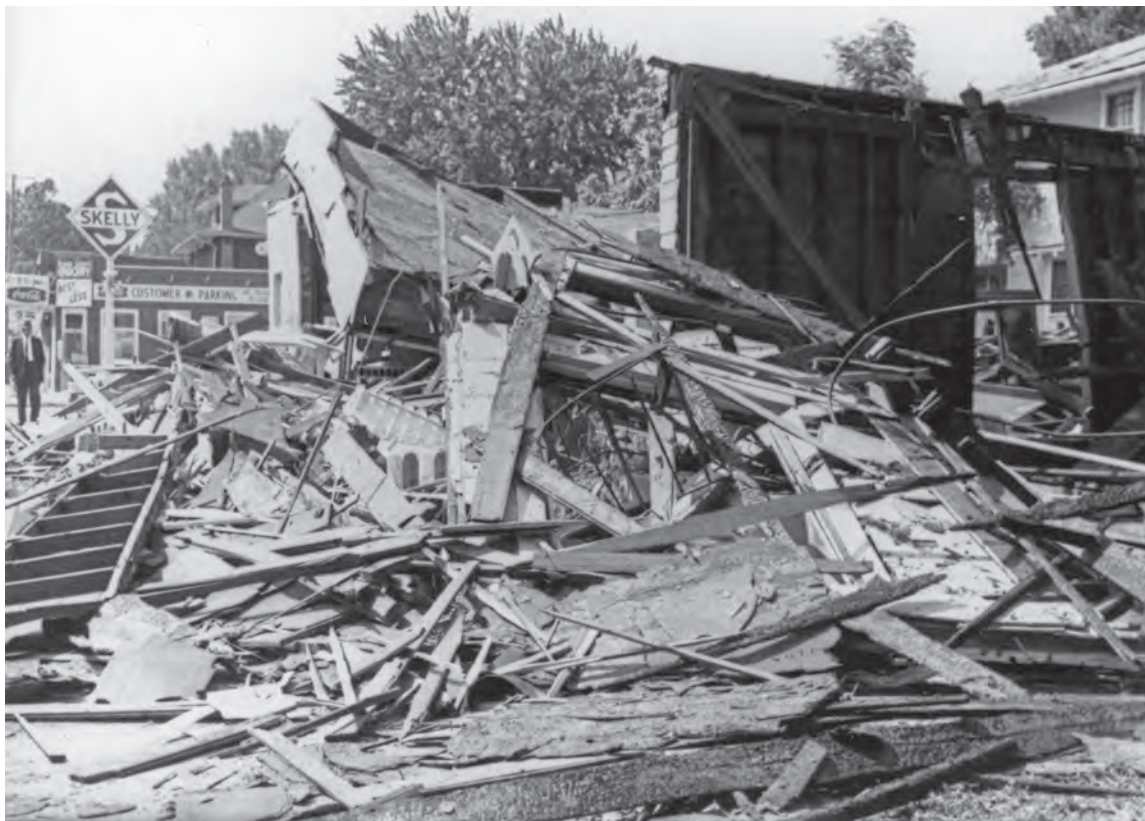
"In a second round of violence in August 1966, a fire set by an arsonist caused an explosion which leveled this café near Omaha's racially disturbed Near North Side 8/3. An adjacent service station and nearby homes were damaged." United Press photo, August 3, 1966. NSHS RG2467-24

Job prospects for young black males were equally poor during this period. In 1960, only 27 percent of black American males ages fourteen to seventeen were actively in the workforce. 45