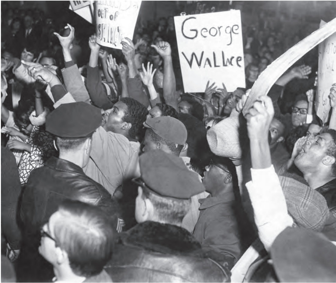
Protestors near the stage demonstrate against George Wallace at the Omaha Civic Auditorium, March 4, 1968.