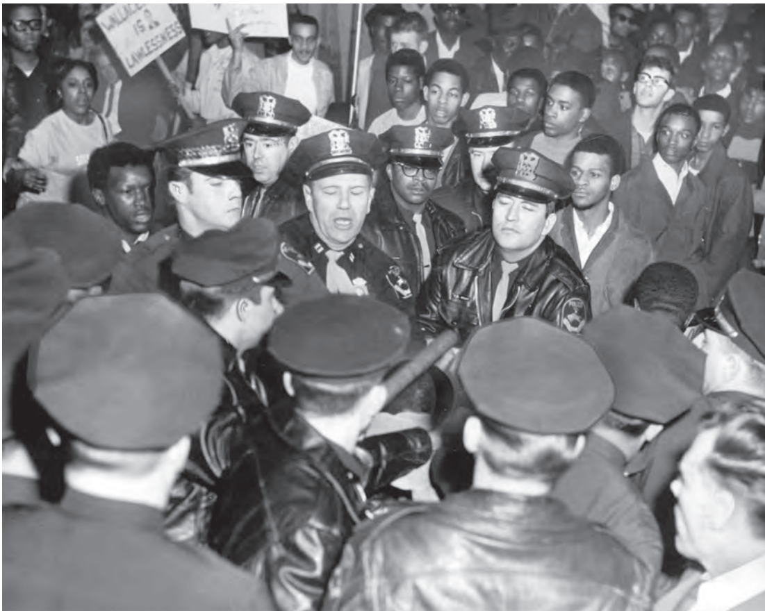
Police subdue an anti-Wallace protestor at the Omaha Civic Auditorium, March 4, 1968.